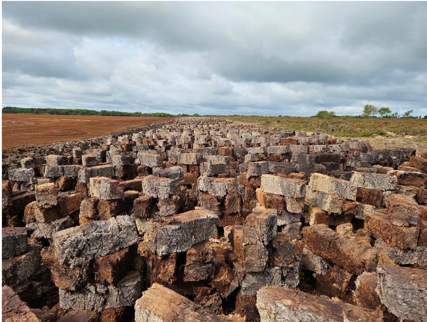
Photo 5: Large sod peat stacked for drying at the Northern part of the peatland.