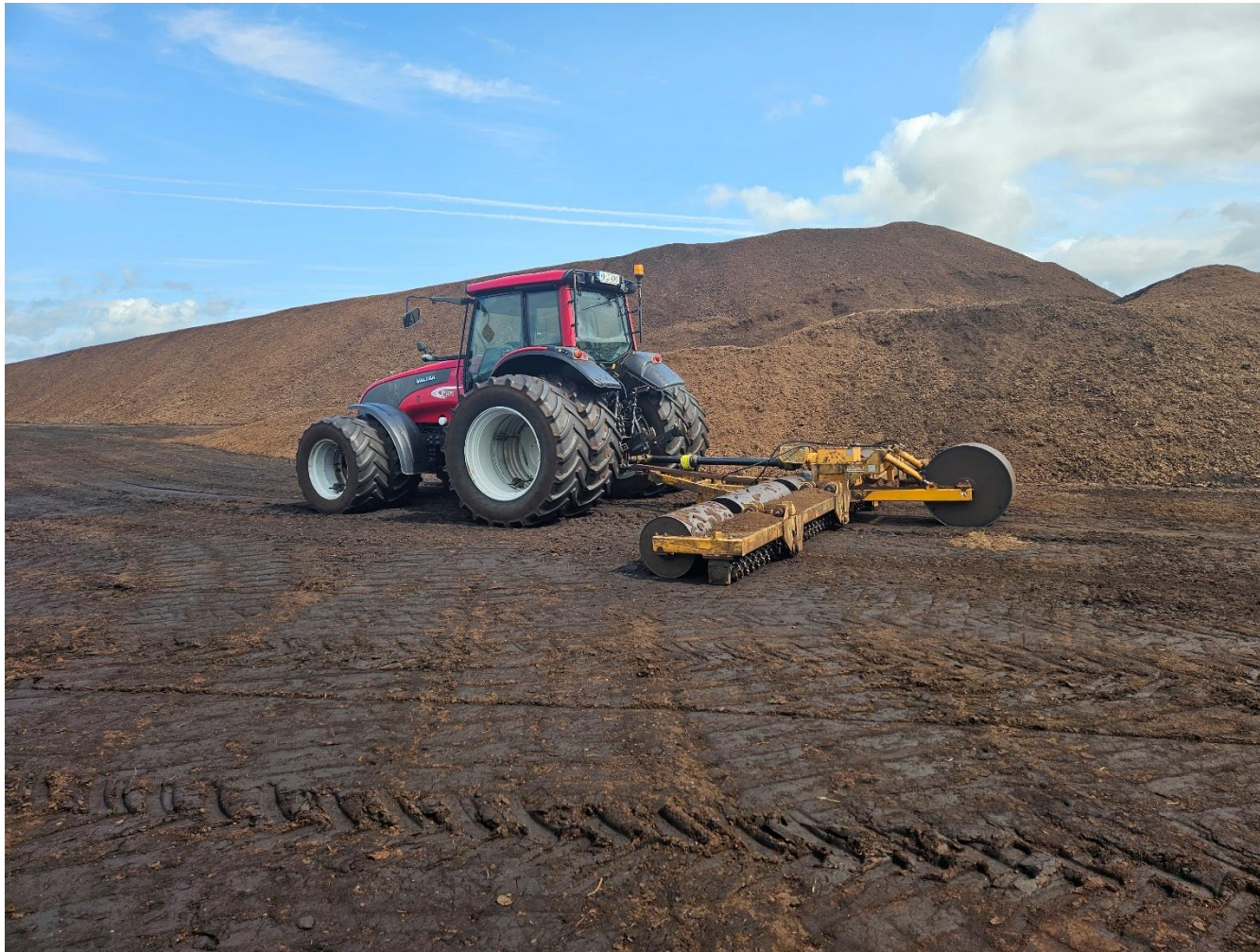
Photo 6: Tractor with 'milling' machine noted adjacent to the stockpiles of milled peat at the loading area.