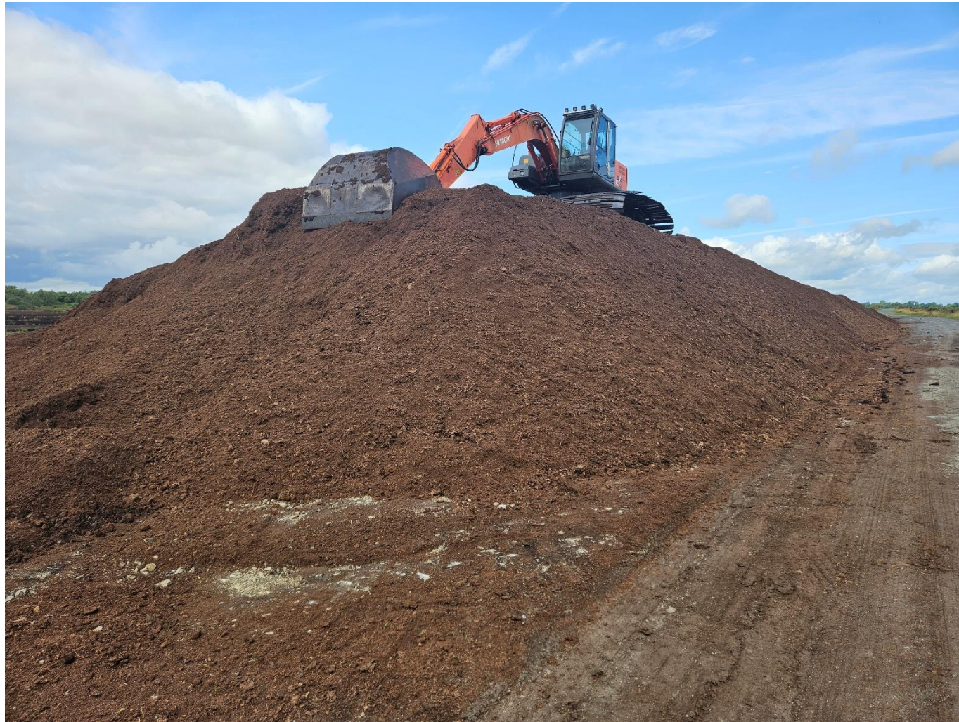
Photo 3: Excavator noted on large stockpile of milled peat at the loading area.