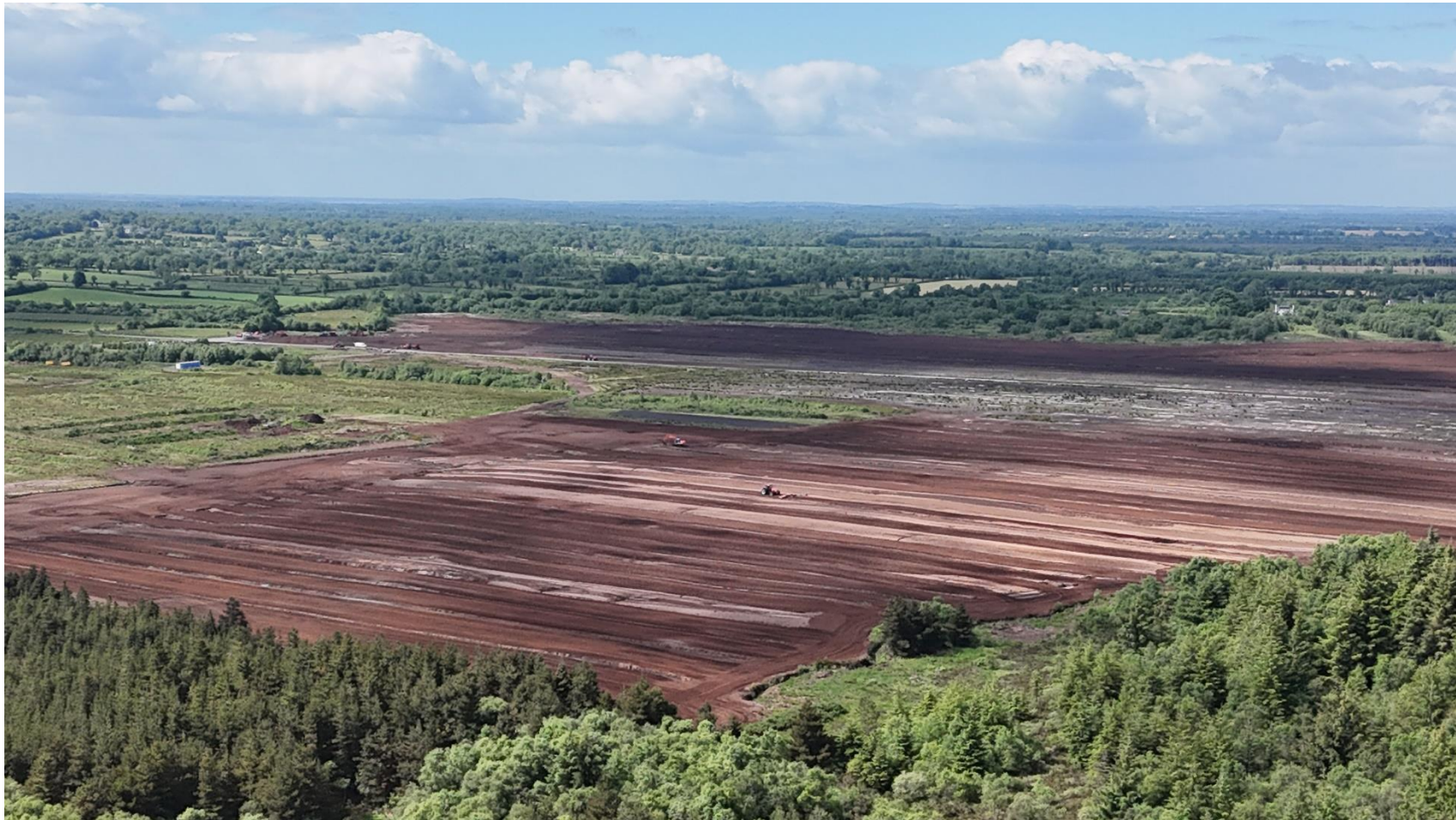
Photo 1: Milled peat extraction activities were taking place on the eastern side of the peatland.