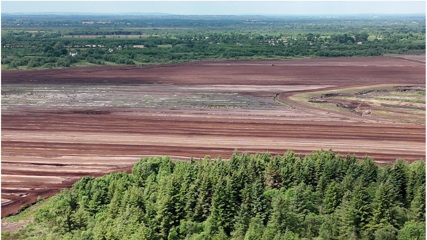
Photo 3: Photo showing milled peat extraction activities were taking place on the western side of the peatland.