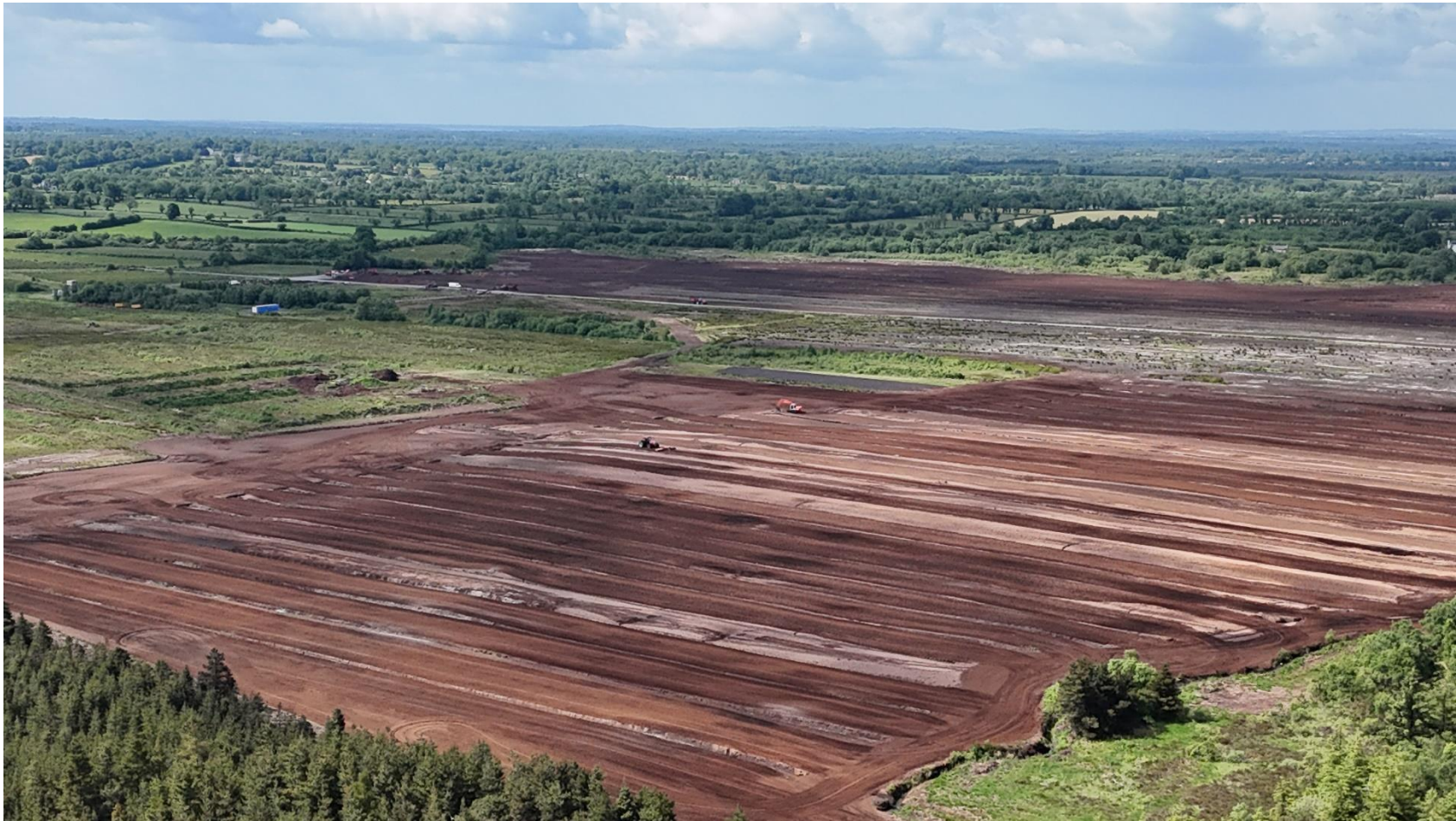
Photo 2: Milled peat extraction activities noted to be taking place on the eastern side of the peatland.