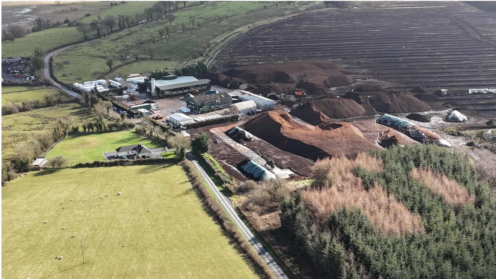
Photo 4: View of the processing facility and stockpiles of milled peat (Area 1).