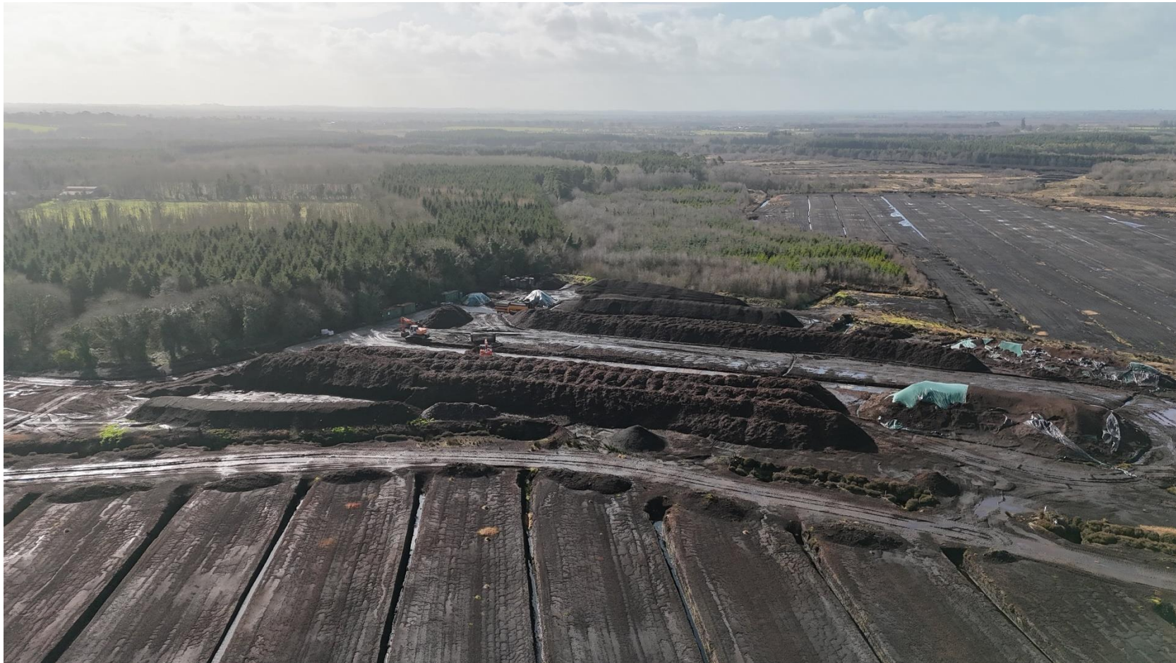
Photo 2: Large stockpiles and excavators noted at loading area of Area 4.