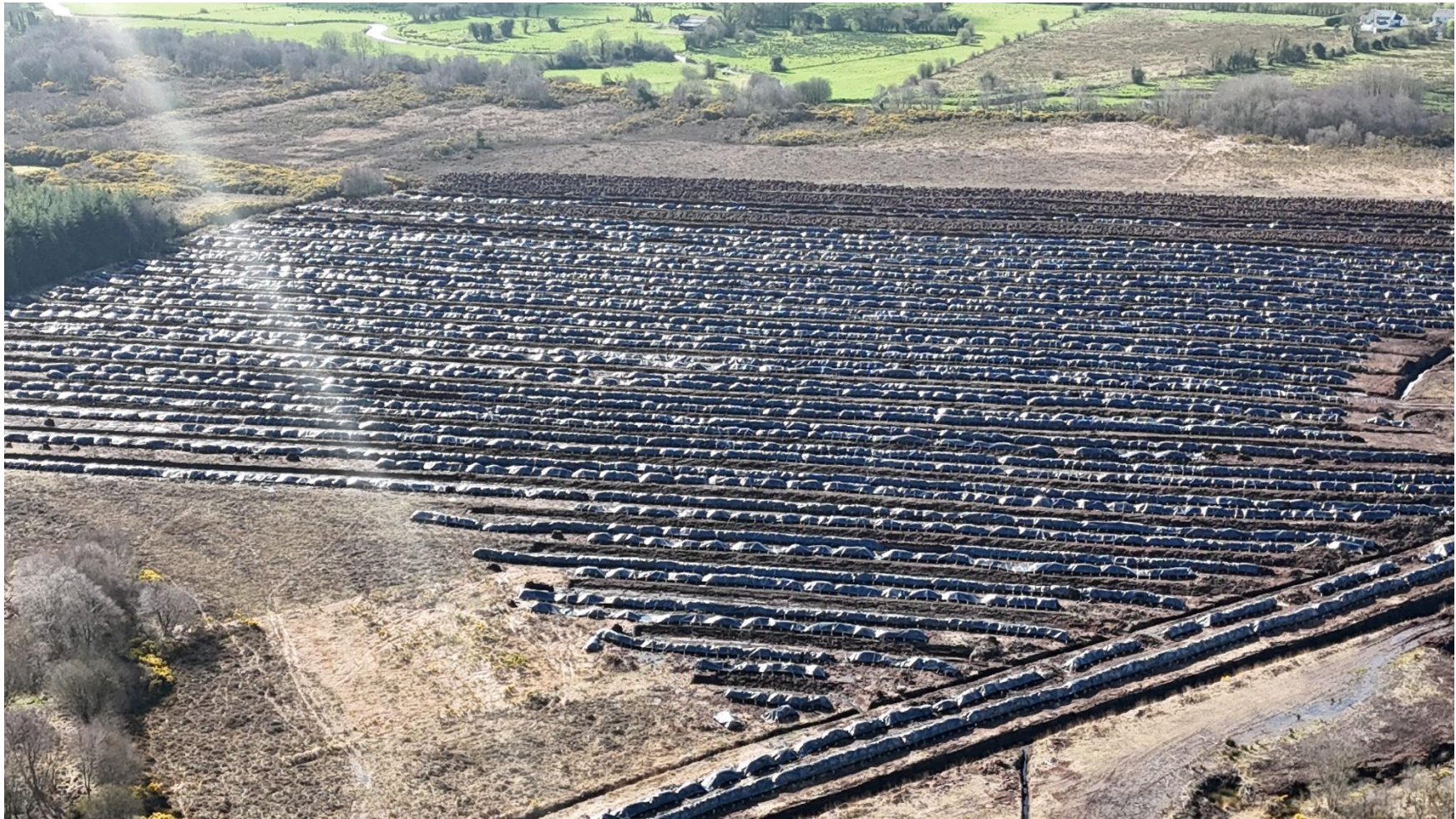
Photo 2: Rows of covered and uncovered large sod peat noted to be stacked on the peatland.