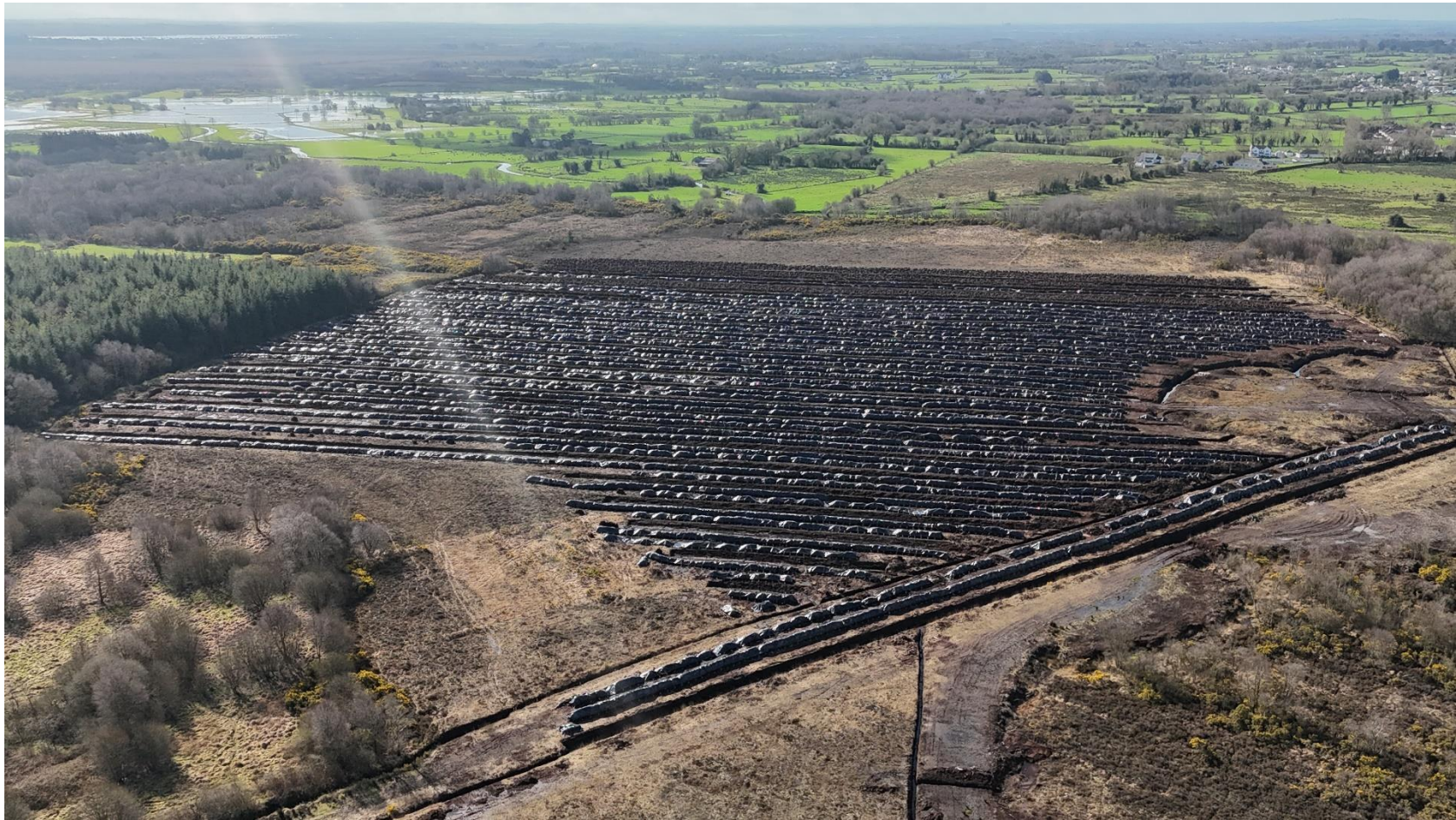
Photo 1: General overview of the peatland where significant quantities of large sod peat had been extracted and left to dry on the peatland.