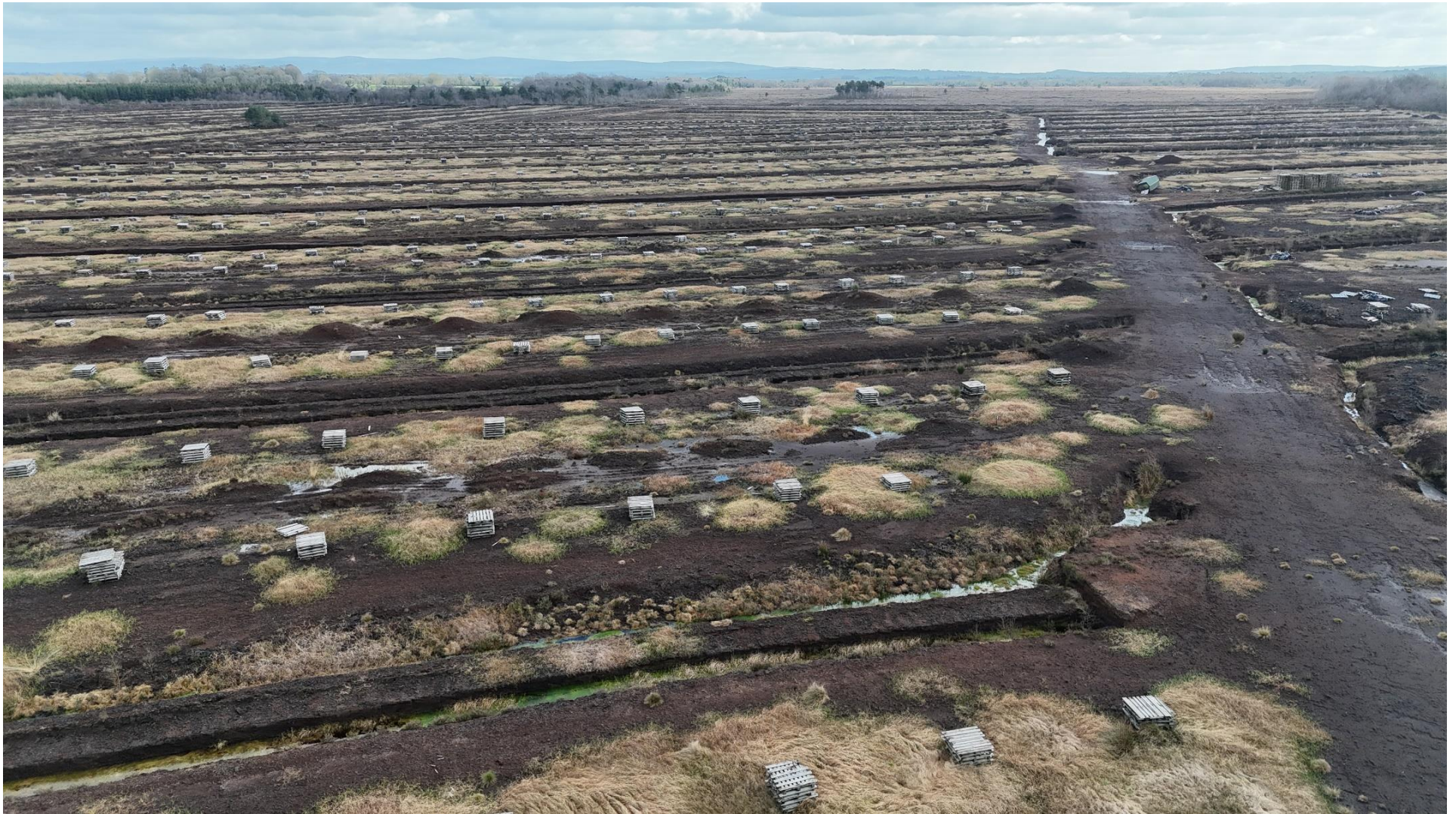
Photograph 2: General overview of the peatland – note the presence of large number of pallets.