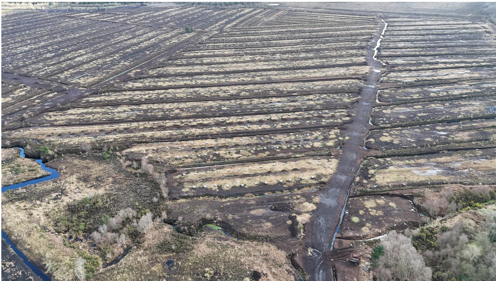
Photograph 1: General overview of the peatland.