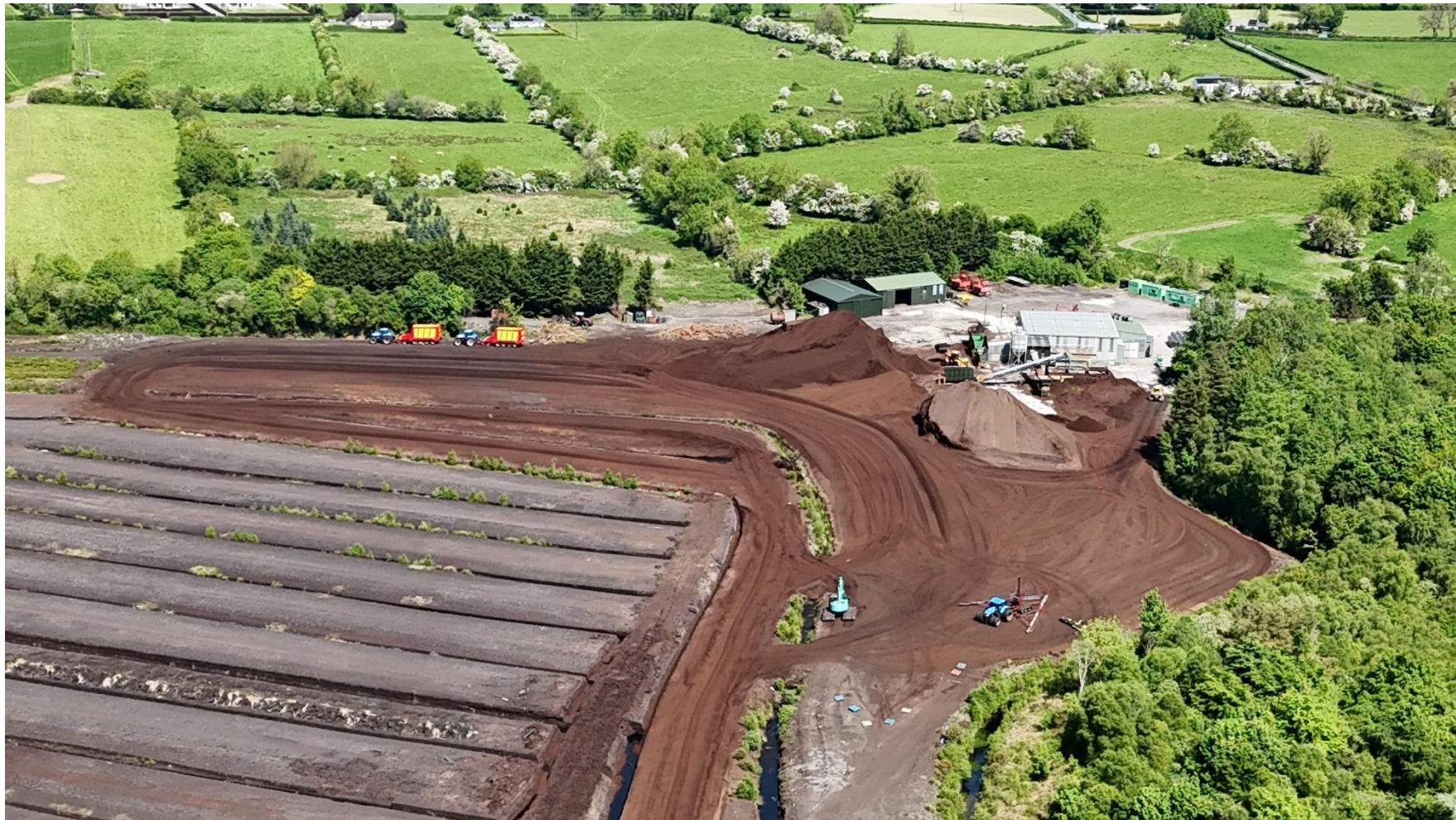
Photo 3: Stockpiles of milled peat along with peat extraction/harvesting equipment and machinery noted adjacent to the bagging/processing plant.