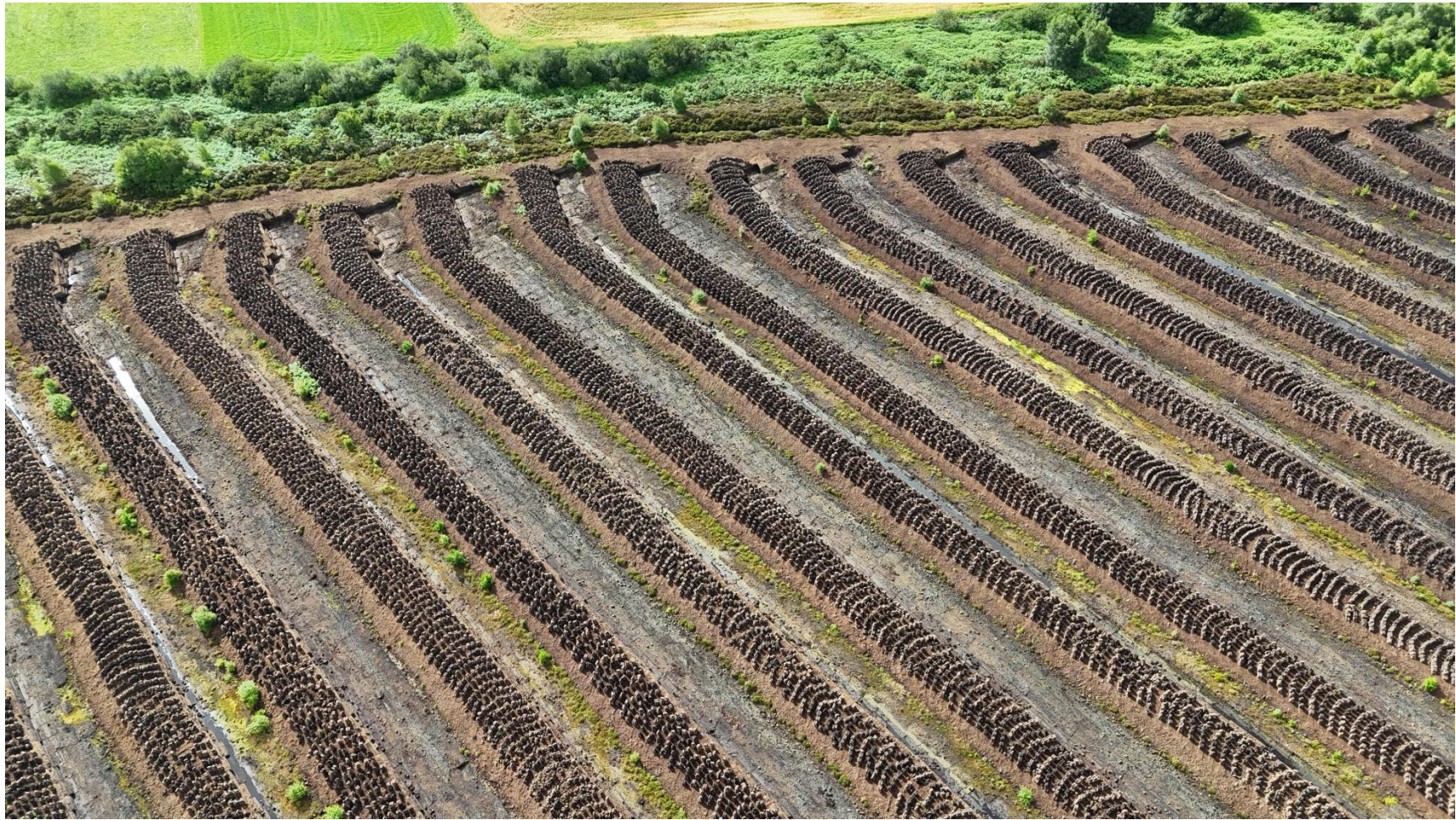
Photo 2: Large sod peat stacked and left out to dry on the peatland.