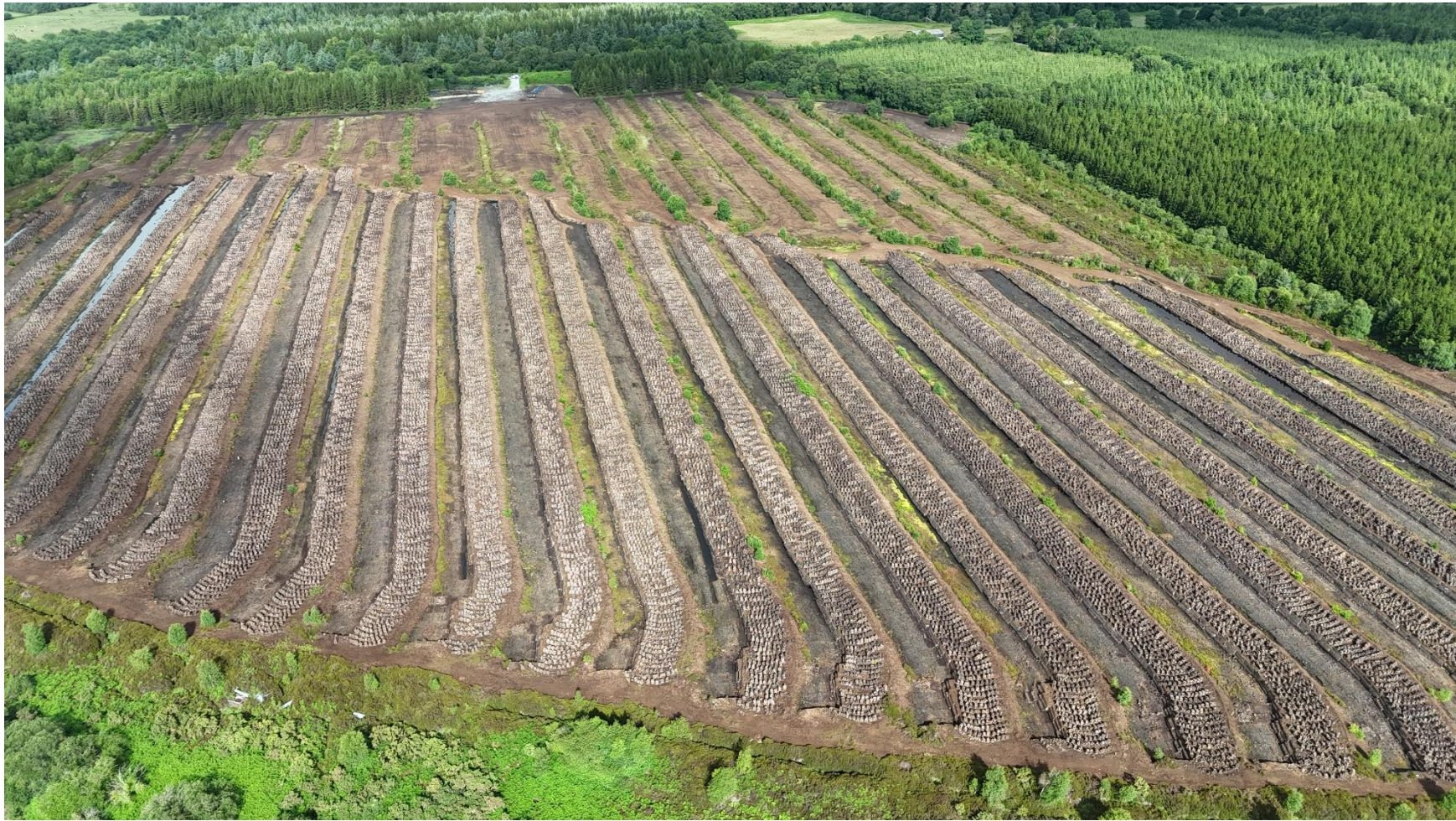
Photo 1: Large sod peat stacked and left out to dry on the peatland.