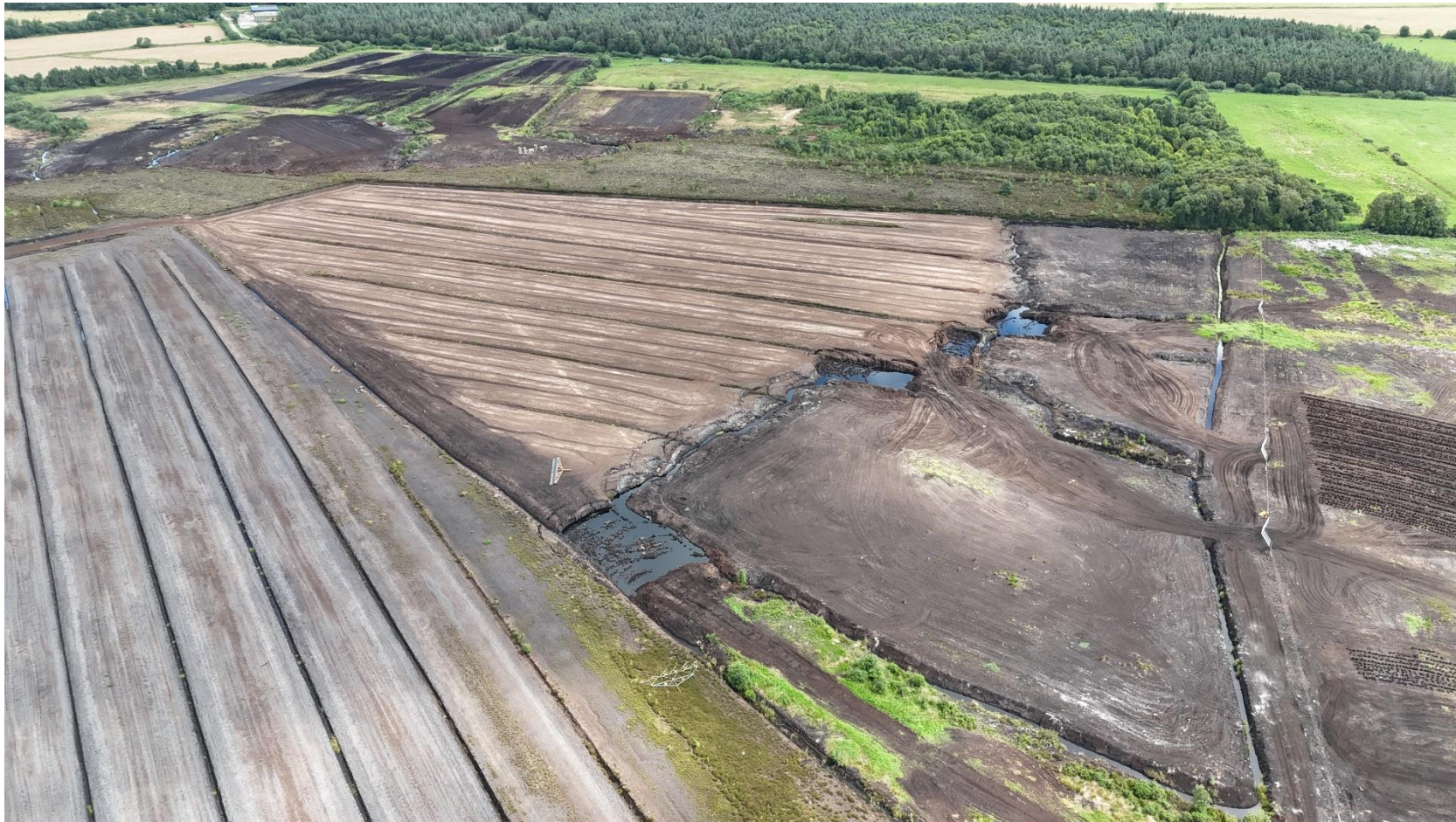
Photo 4: Peat extraction/harvesting machinery noted on adjoining peatland in the overall bog complex.