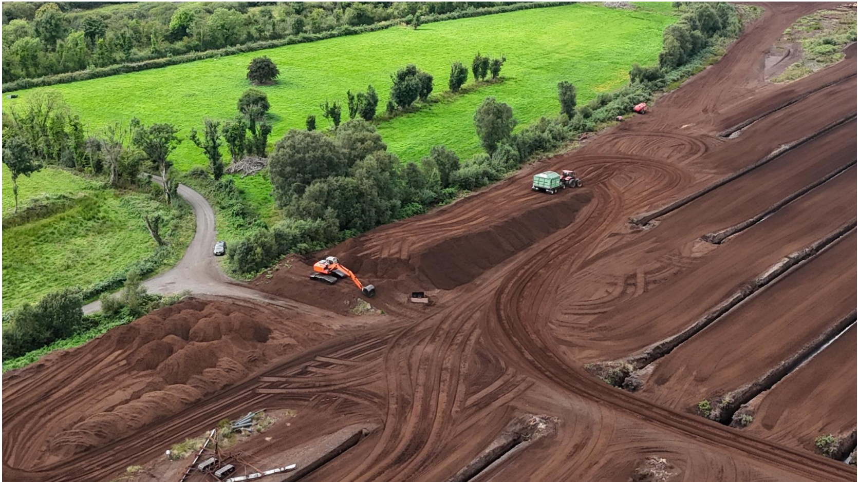
Photo 4: Stockpiles of milled peat noted, also note milled peat which was collected from the peatland being deposited on a stockpile.