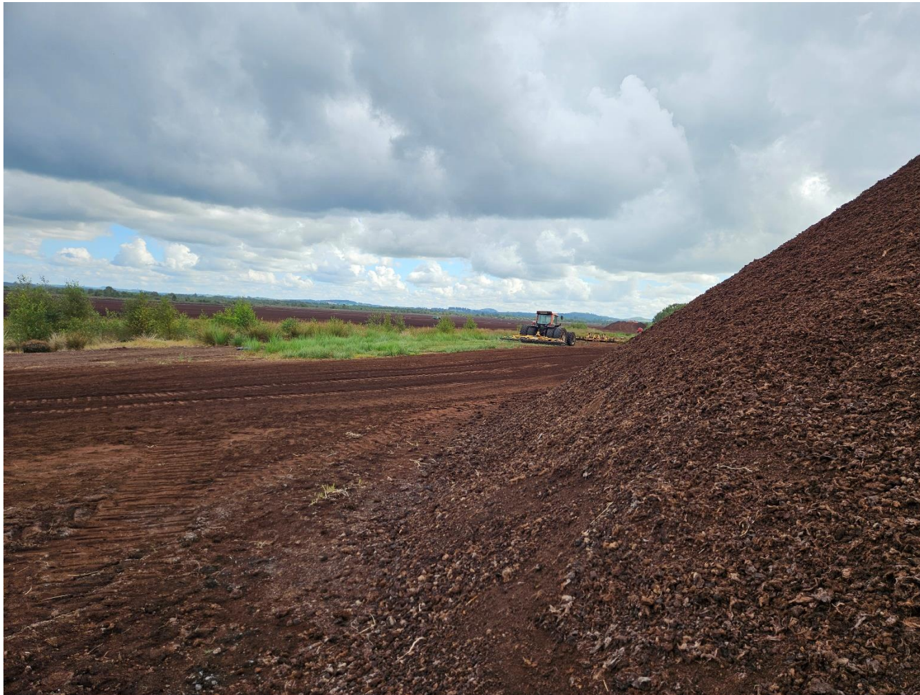
Photo 1: Peat extraction/harvesting machinery noted alongside milled peat stockpile at entrance to the peatland.