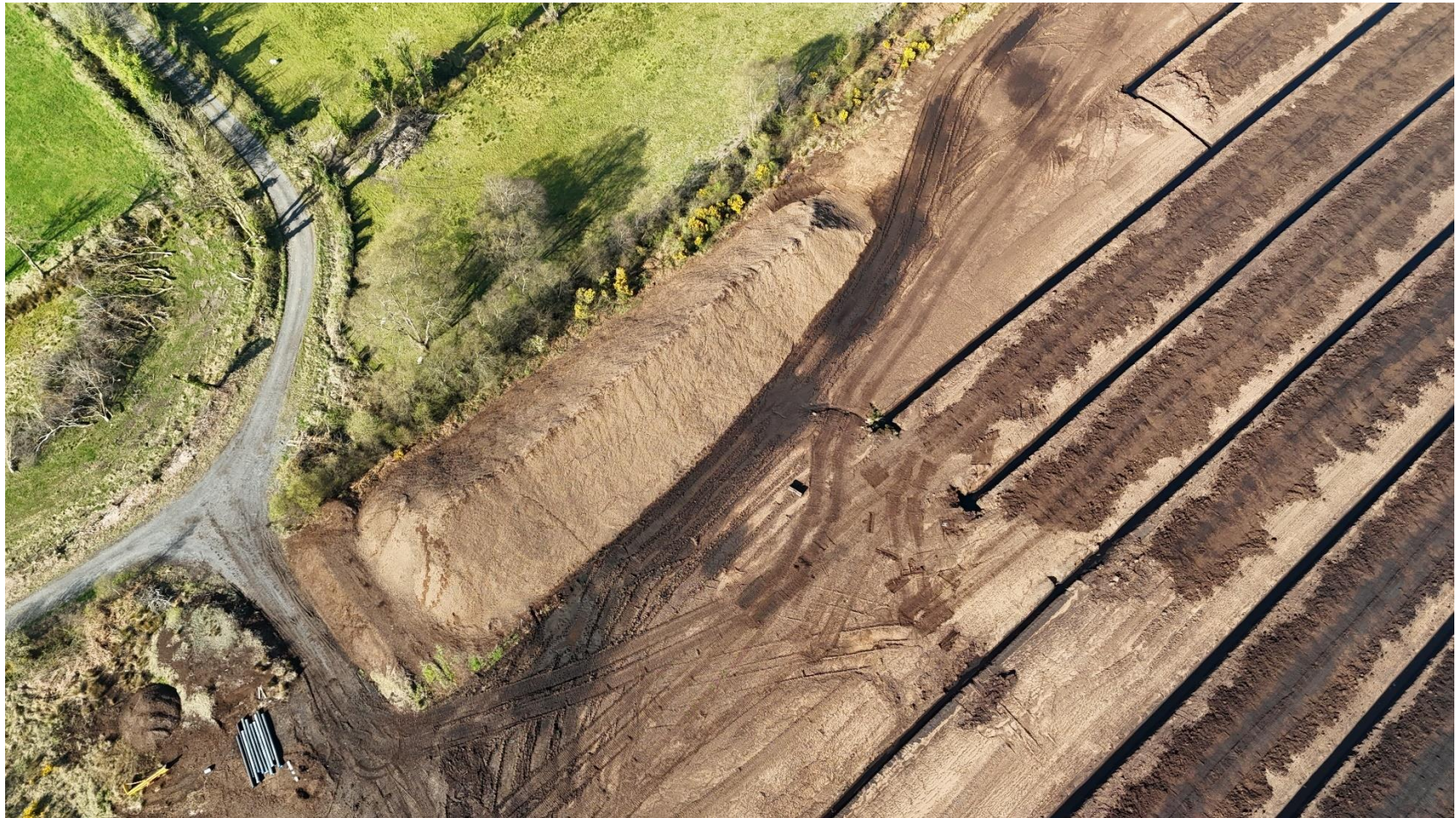
Photo 4: Stockpile of milled peat noted at the western entrance to the peatland.