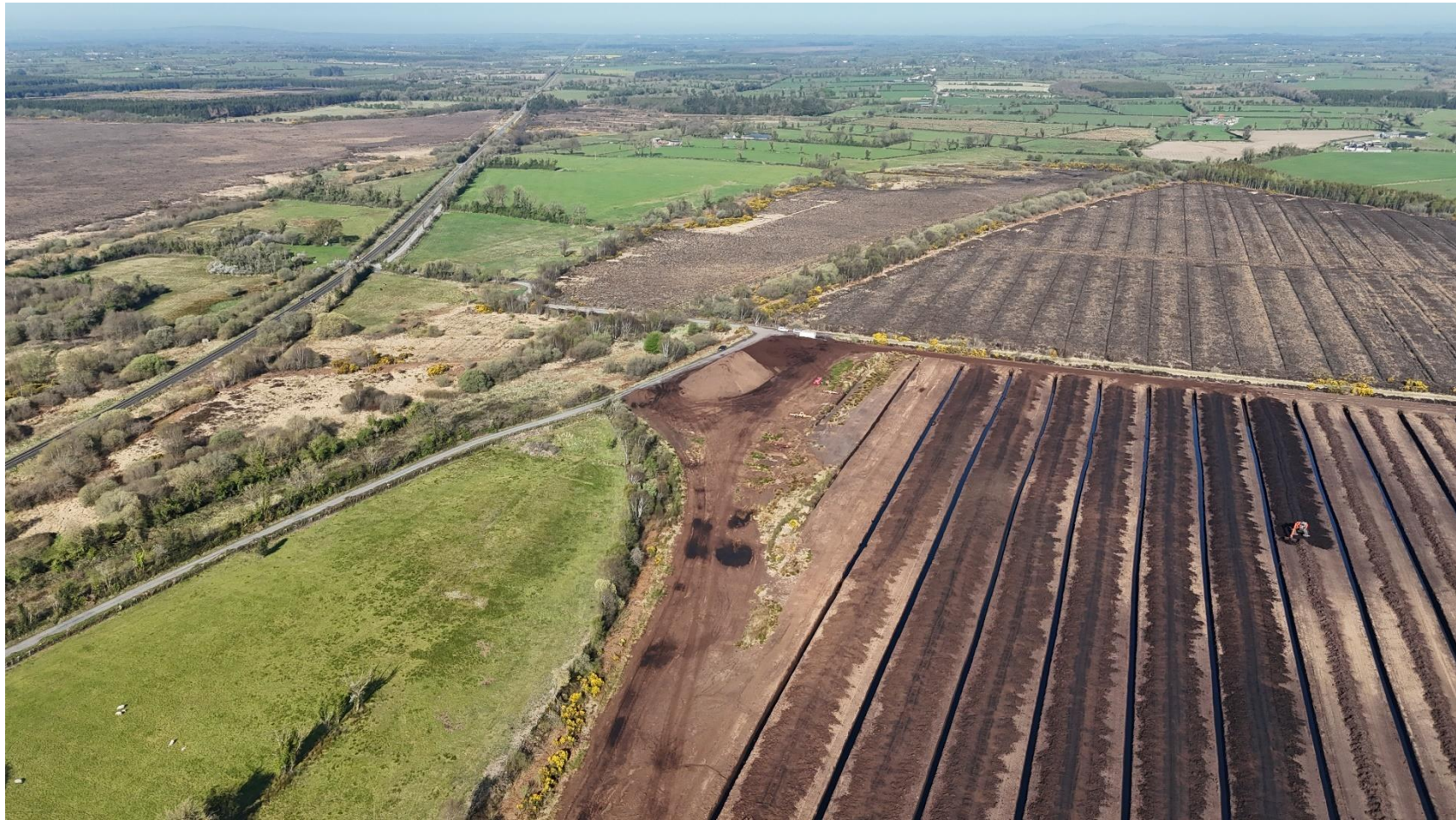
Photo 3: Stockpile of milled peat and peat harvesting machinery noted at the north western entrance to the peatland.