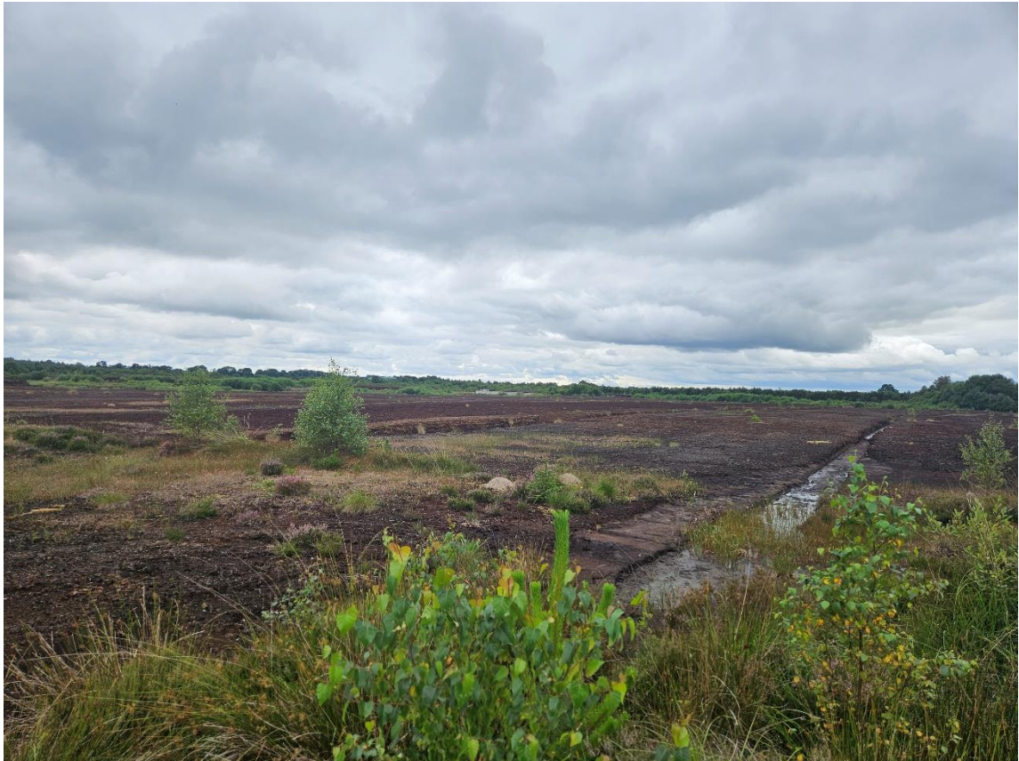
Photo 1: No peat excavation noted to be taking place on the peatland.