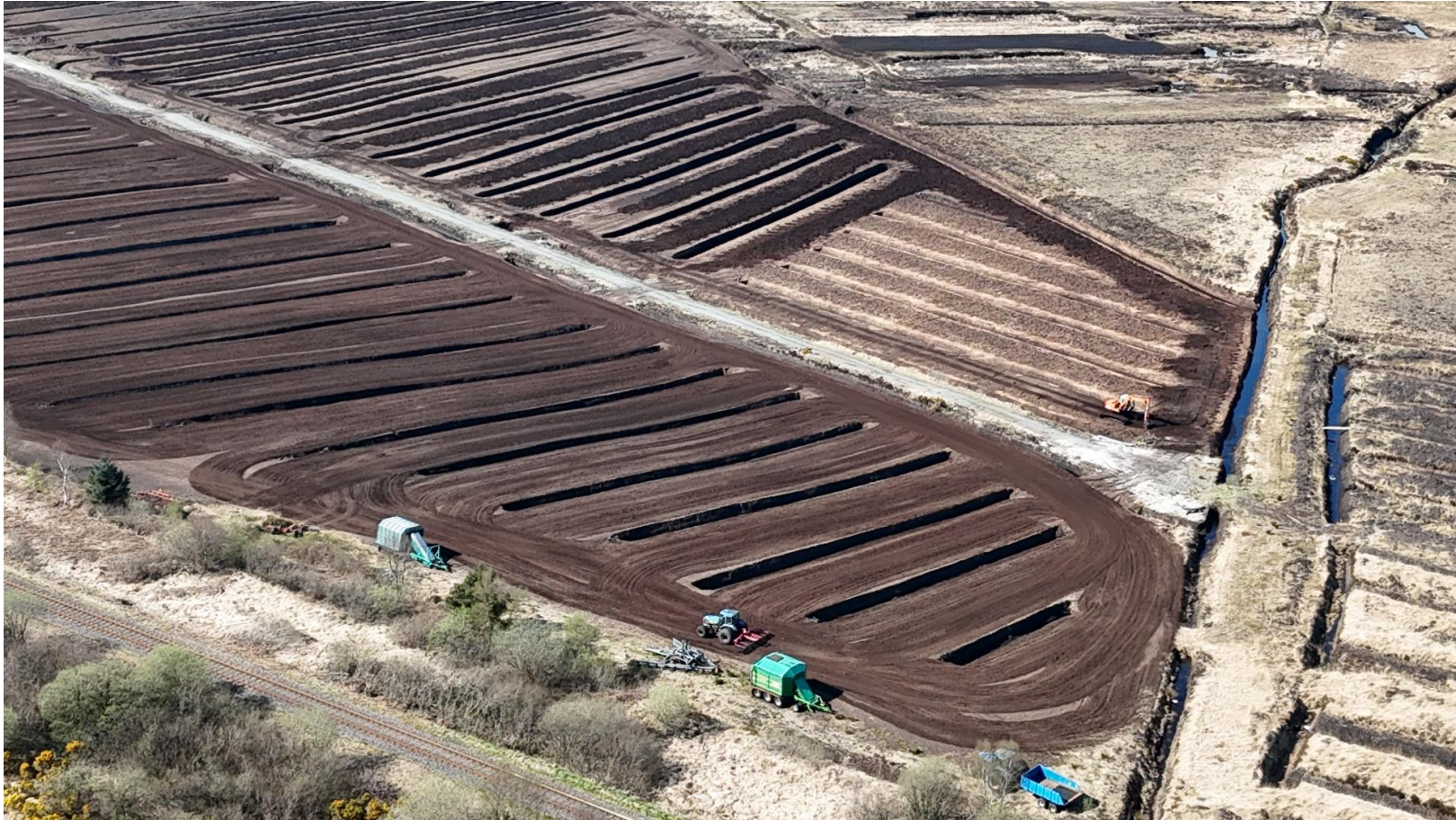
Photo 2: Peat harvesting machinery noted to be parked on the peatland and excavator had been clearing drains.