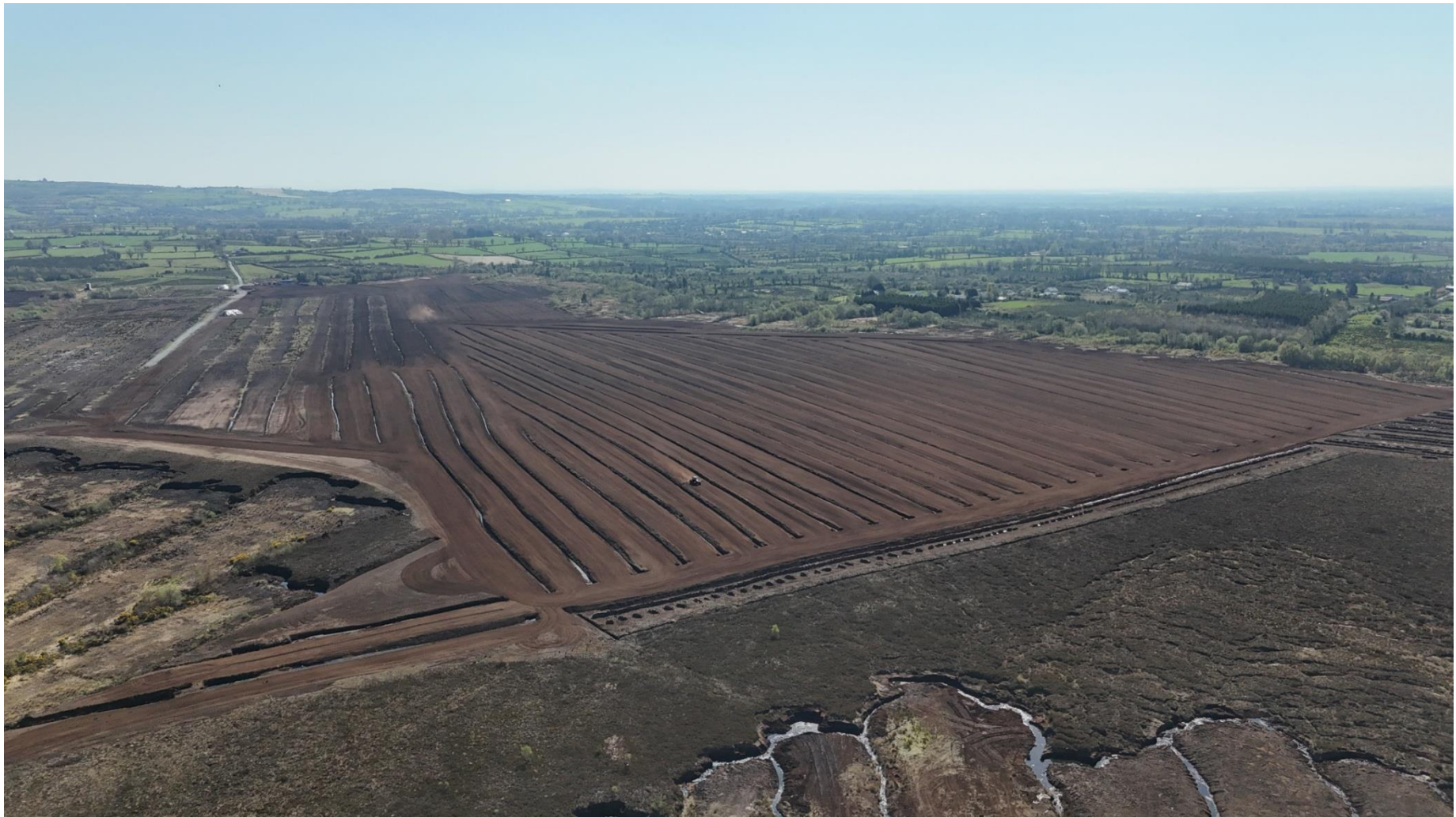
Photo 2 - Peatlands to the west of the central access road where peat extraction activities were occurring at the time of the visit.