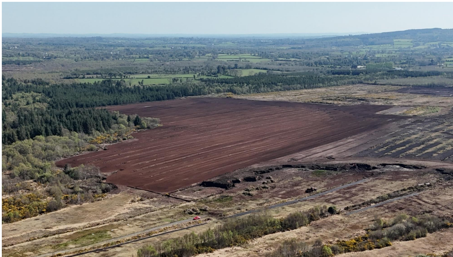
Photo 2 – Area to the east of the peatlands where milled peat extraction had taken place.