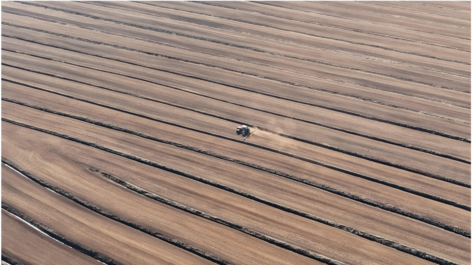
Photo 4 -Milled peat extraction activities noted to be taking place during the visit.