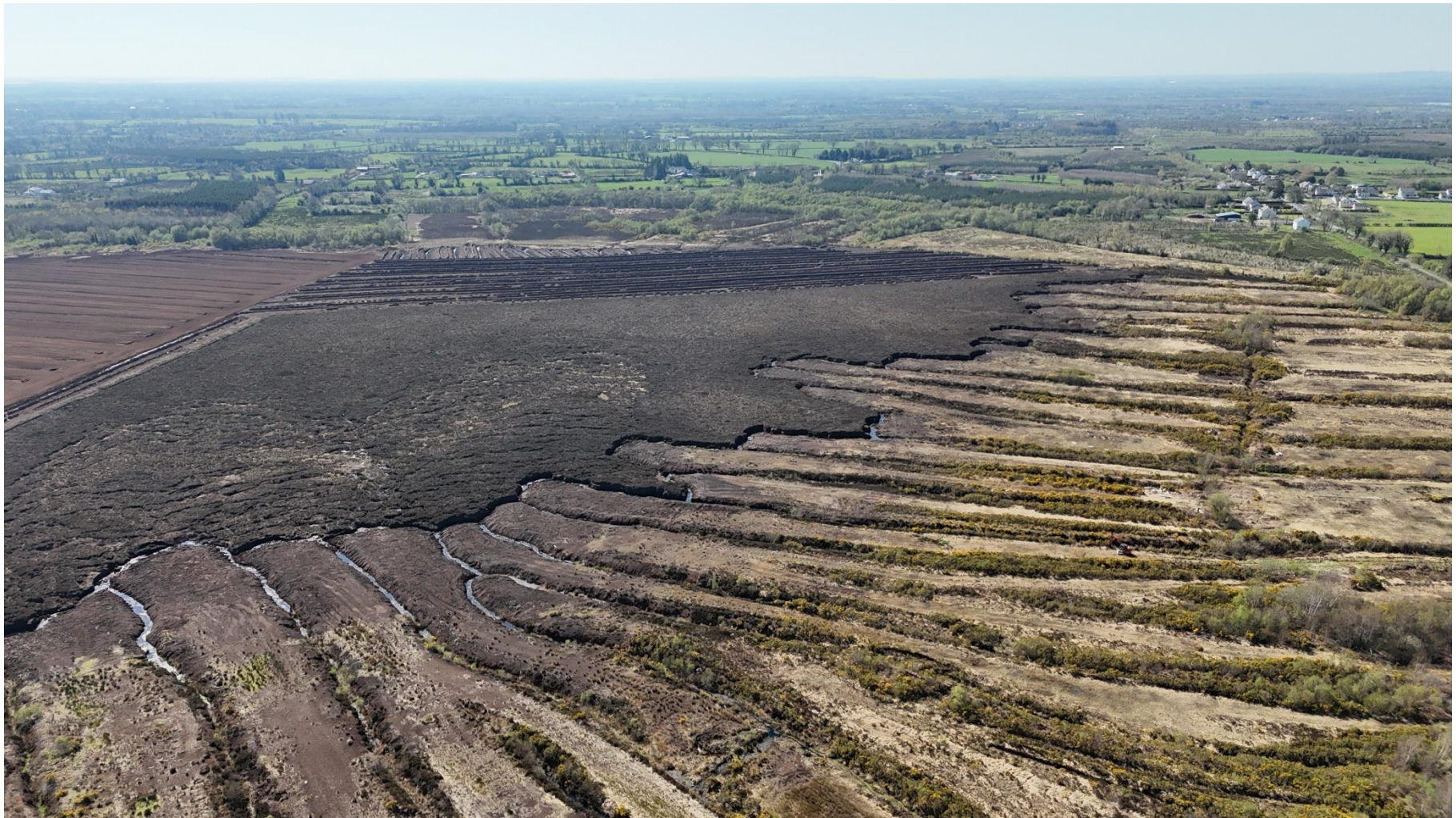
Photo 1 – Area to the north west of the peatlands where large sod peat had been excavated.