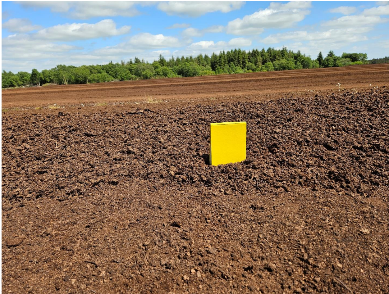
Photo 3– Milled peat which was ‘ridged’ and awaiting collection from the eastern section of the peatland.