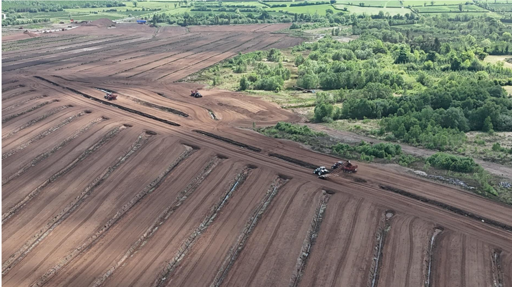
Photo 5 - Milled peat extraction (i.e. collection and transportation of the milled peat) noted to be taking place at the western section of the peatland during the visit.