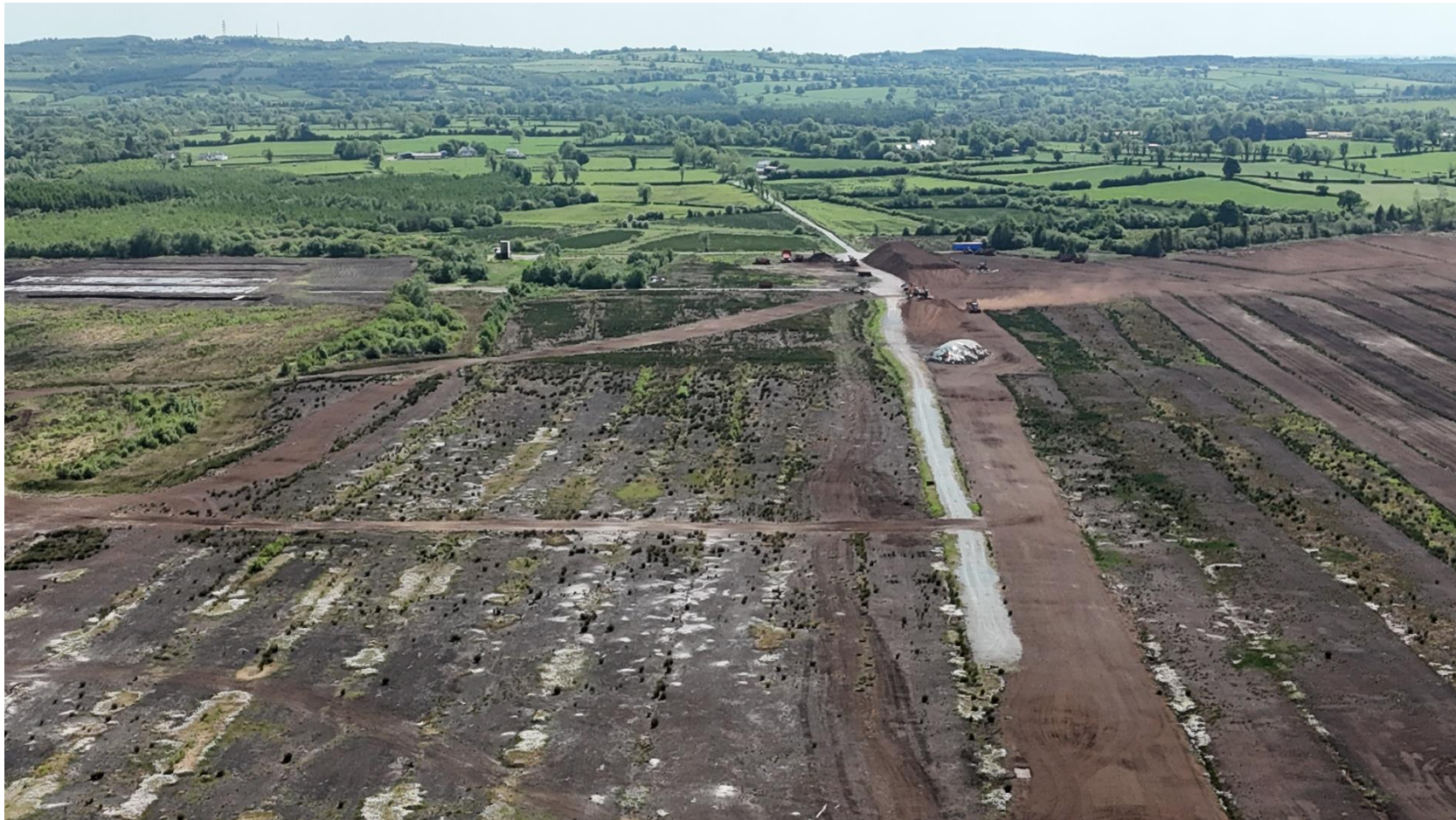
Photo 7– General overview of the loading area, significant stockpiles of milled peat noted here along with peat extraction/harvesting machinery and equipment.