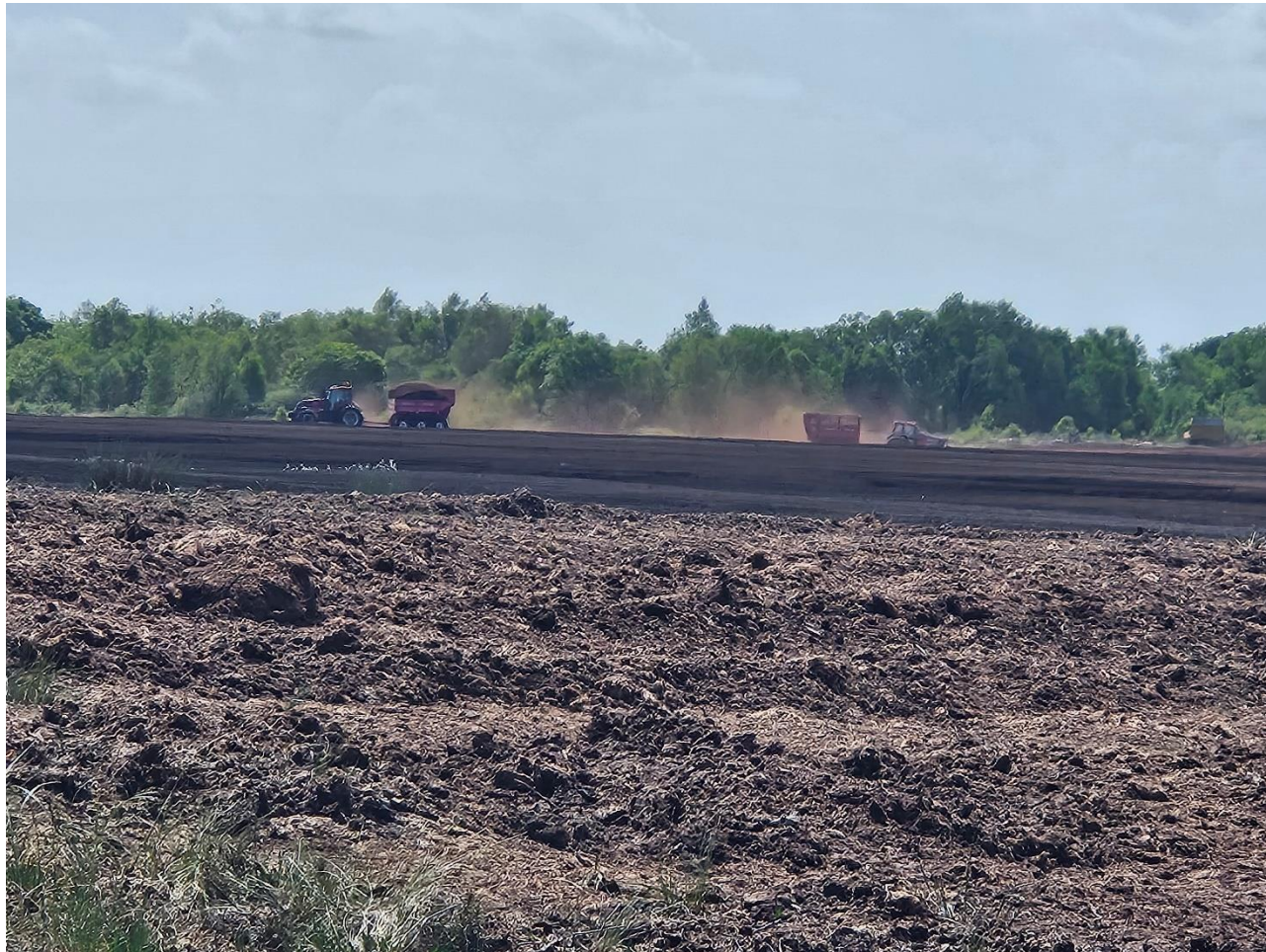
Photo 4 - Tractors and trailers noted to be operating at the western section of the peatland.