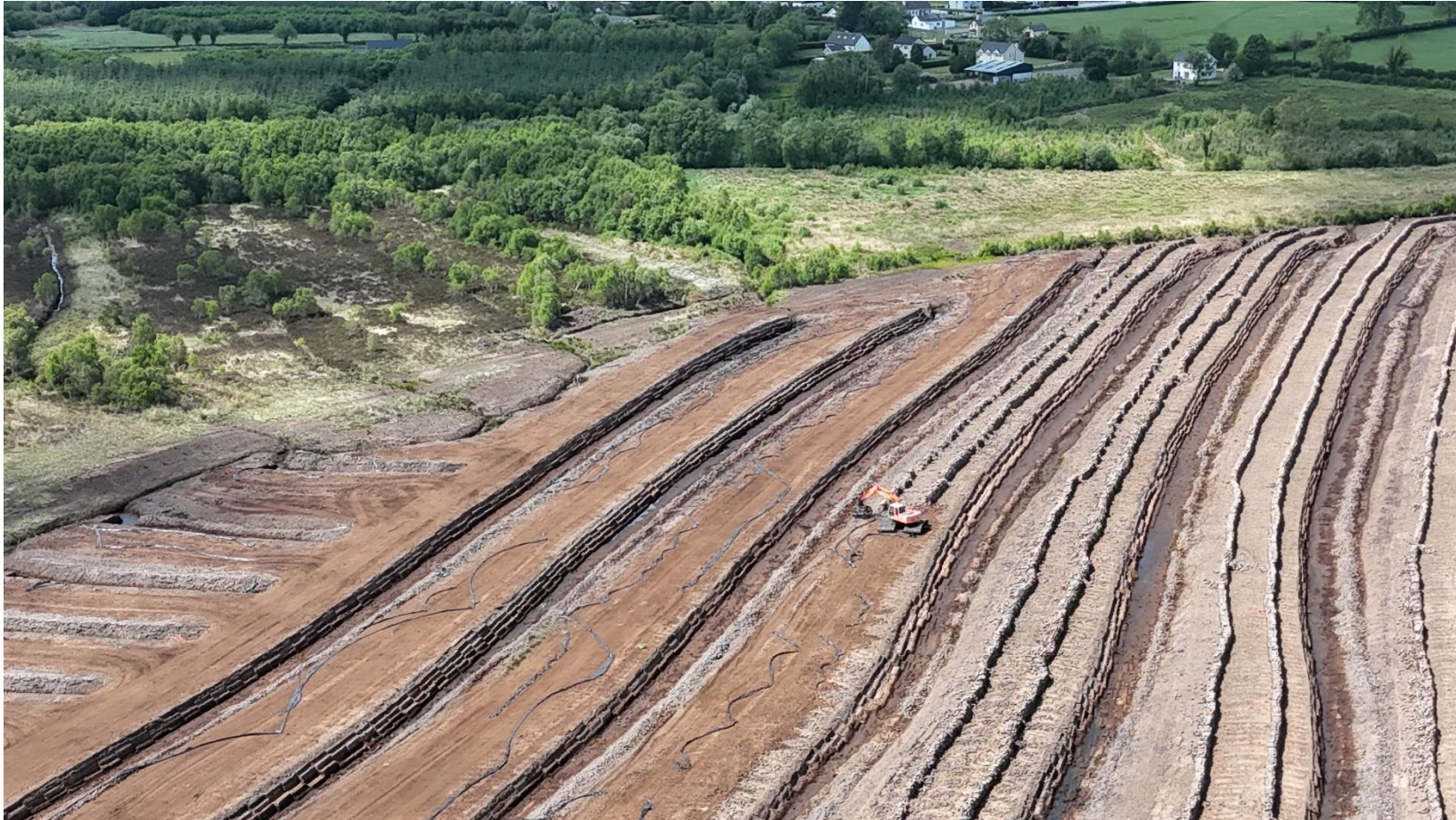
Photo 1 – Excavator parked at the ‘Large sod peat’ area of the north/north western section of the peatland. Note some large sod peat had been removed since the previous Agency visit.