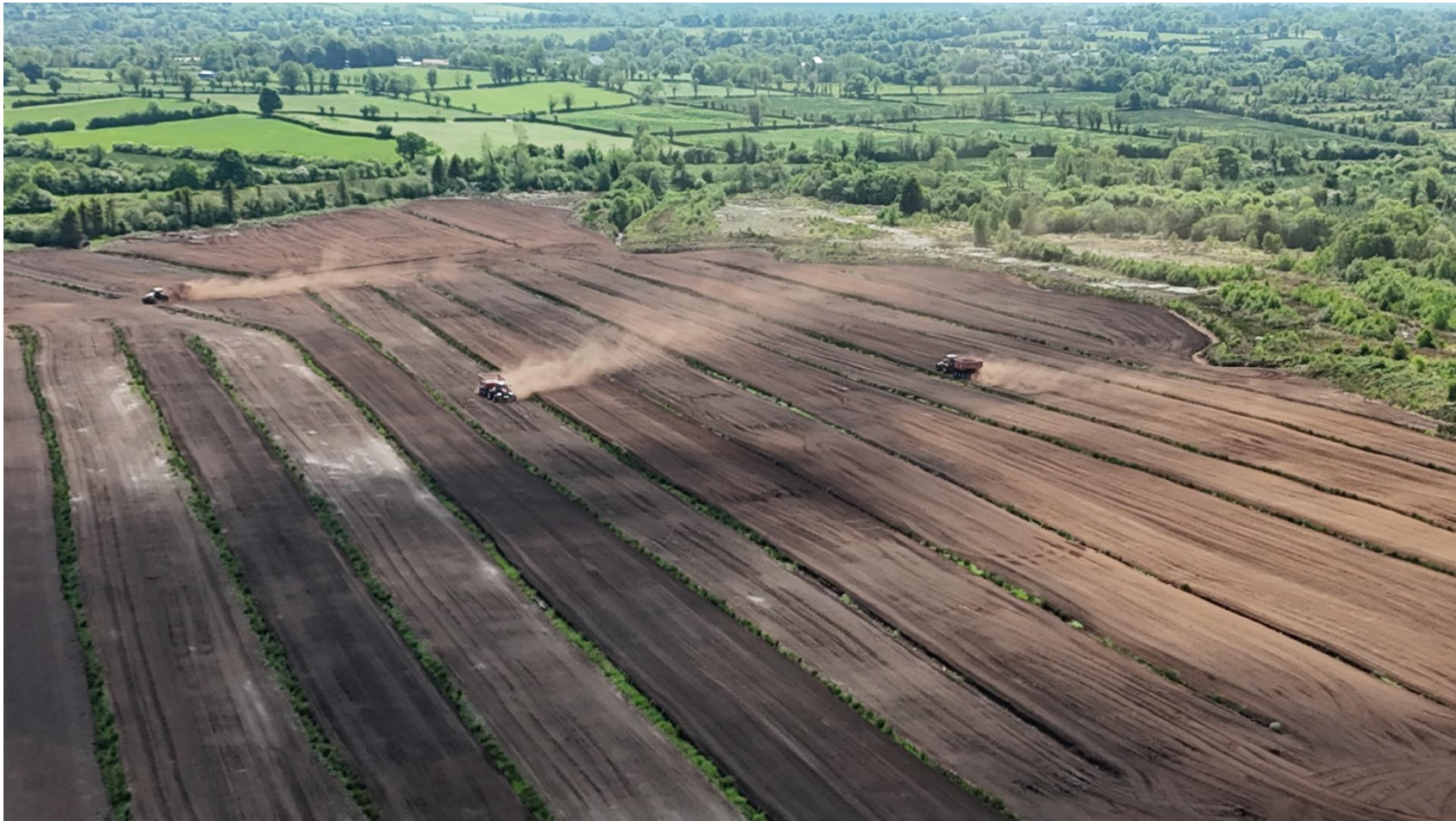
Photo 6 - Tractors and trailers noted to be operating at the western section of the peatland.