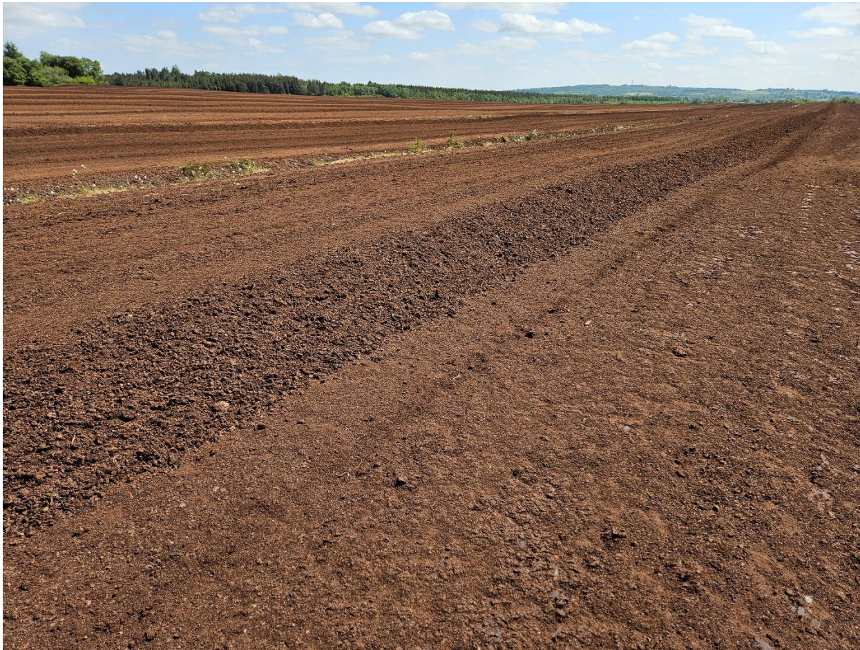
Photo 2– Milled peat which was ‘ridged’ and awaiting collection from the eastern section of the peatland.