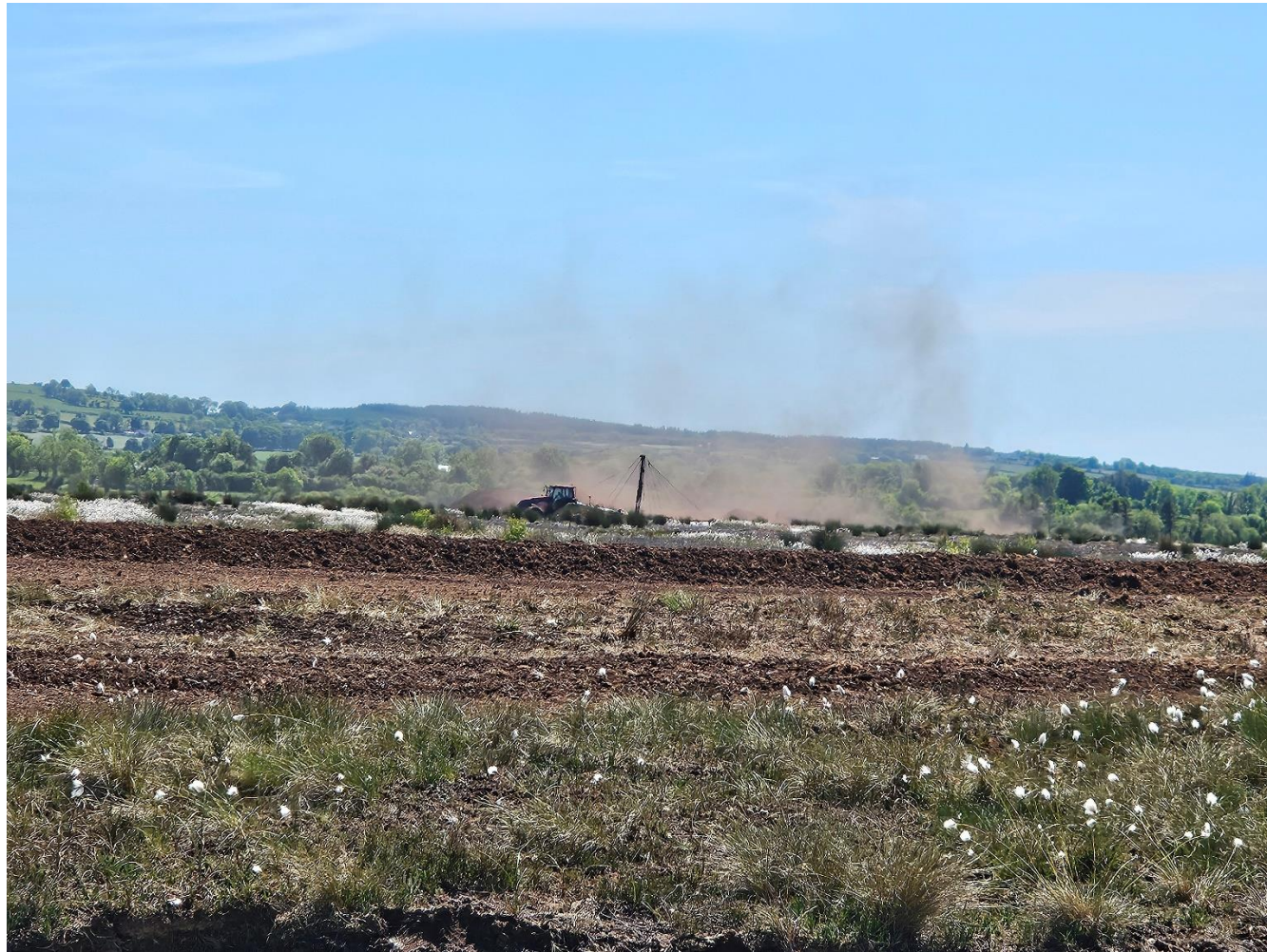
Photo 4: Significant dust emissions noted from the ‘ridging’ of milled peat.