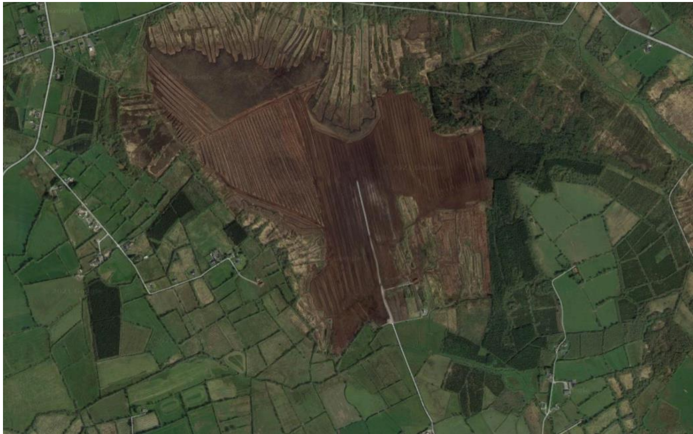
Figure 2 – Overview of the peatland.