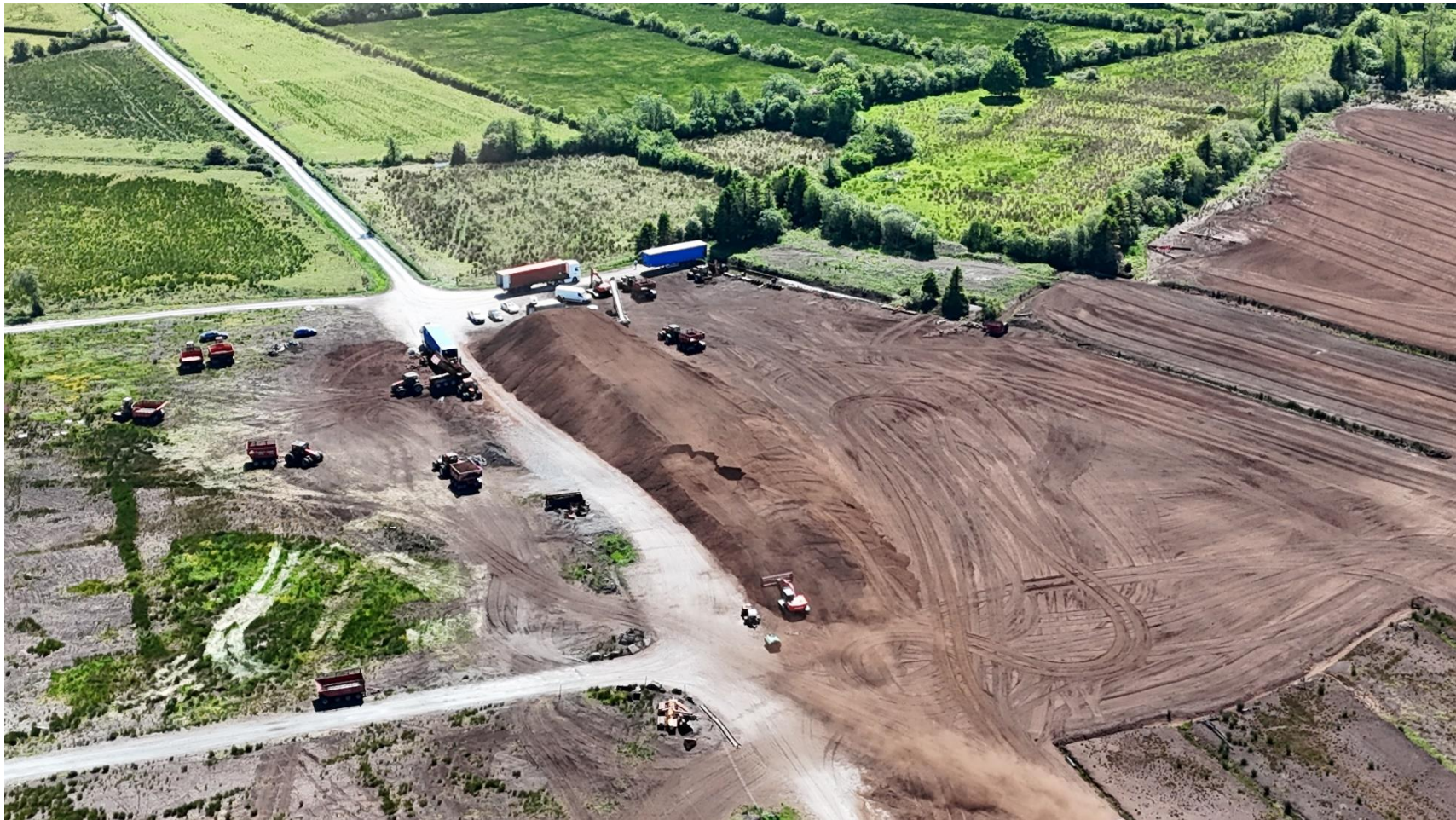
Photo 9: Photo showing one of the stockpiles of milled peat at the loading area which was noted to have got significantly bigger since the Agency's previous visits. Also note the presence of articulated vehicles.