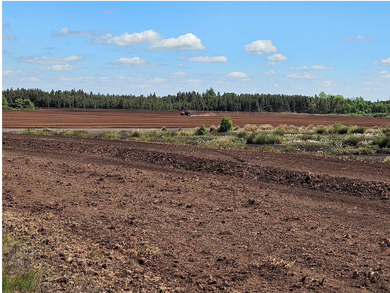
Photo 8: The ‘ridging’ of milled peat which was ongoing during the visit.