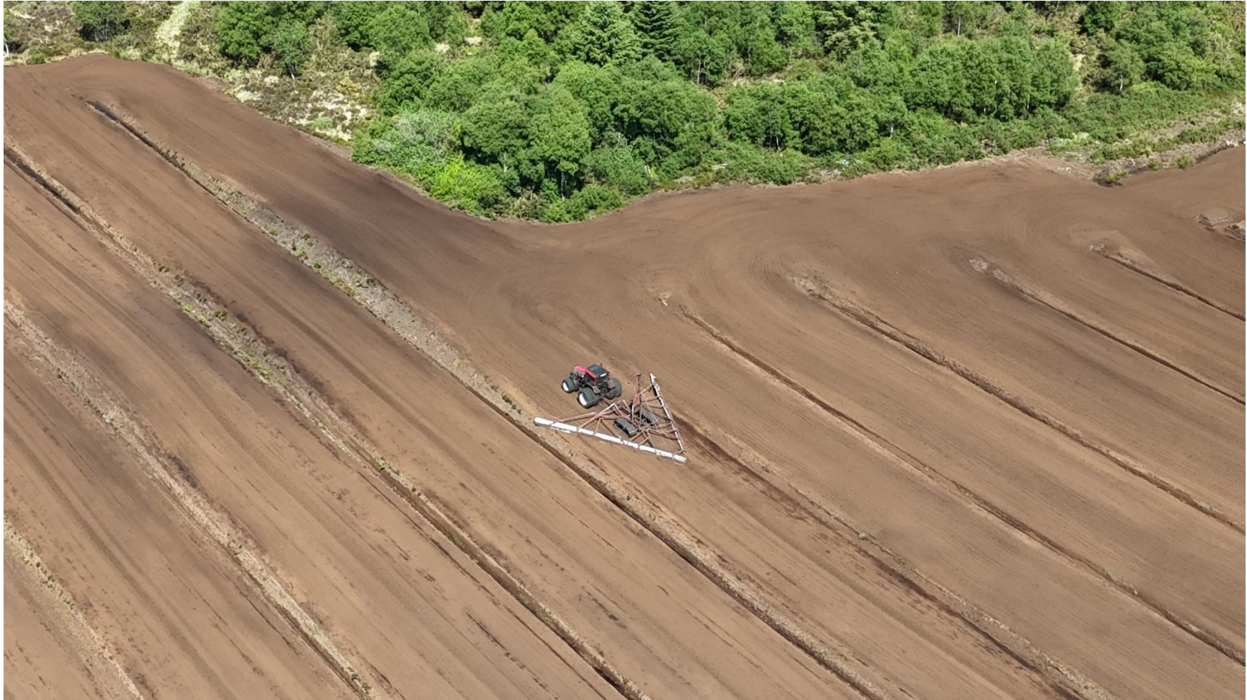
Photo 5: The ‘ridging’ of milled peat which was ongoing during the visit.