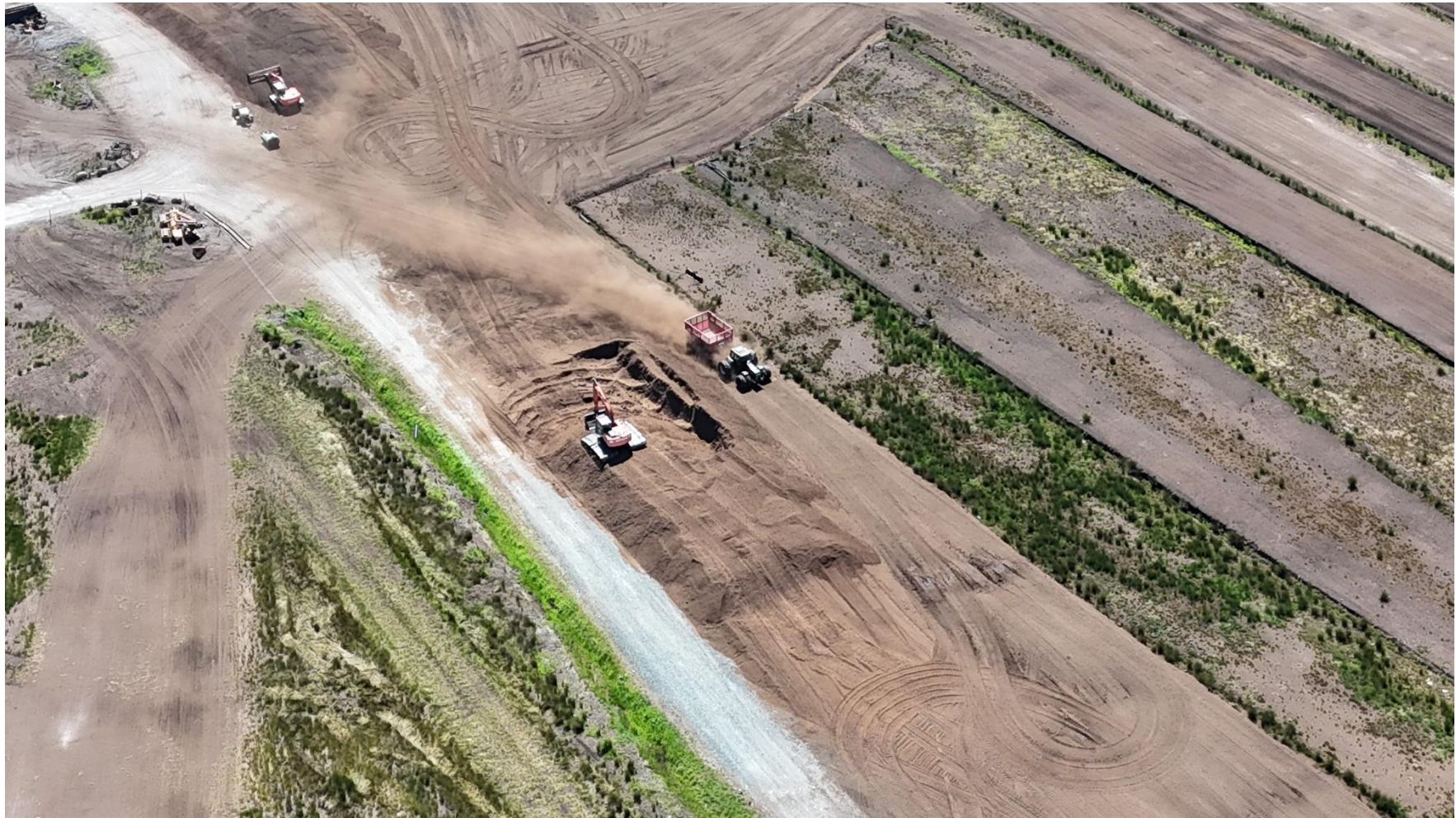
Photo 10: A second stockpile of milled peat noted at the loading area. Note also significant dust emissions arising from the movement of machinery.