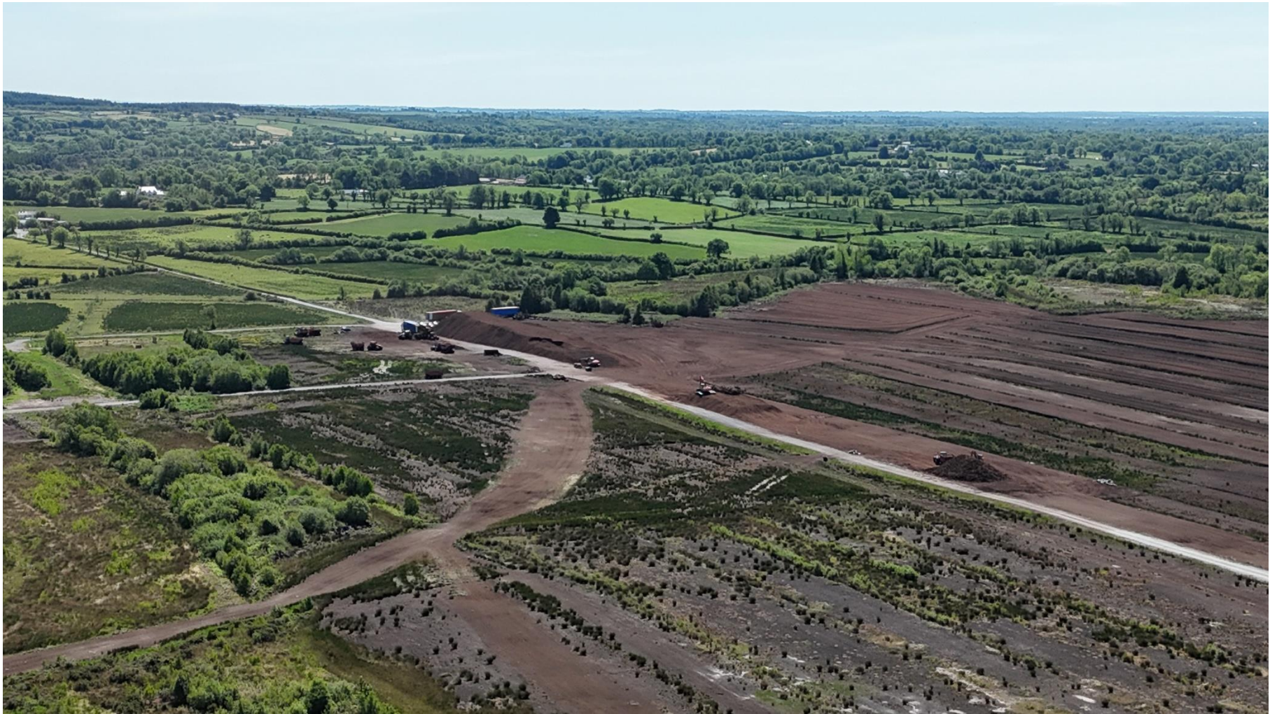
Photo 11: General overview of the loading area showing the two stockpiles of milled peat and a stockpile of large sod peat.