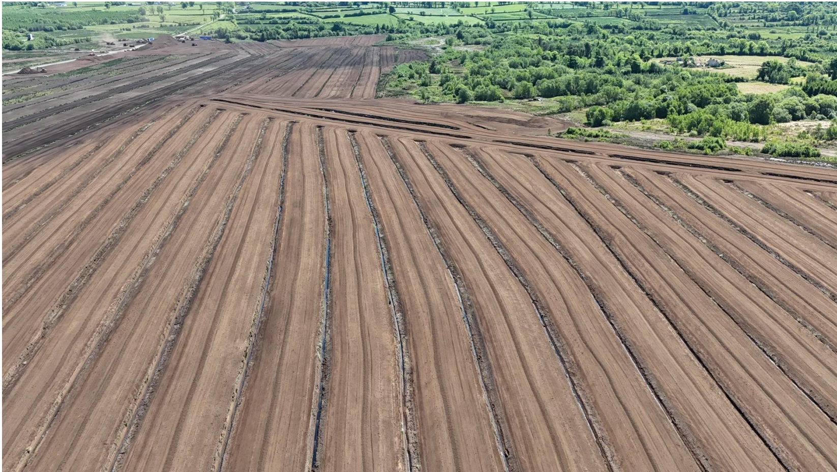
Photo 2: Milled peat which was ‘ridged’ and awaiting collection from the peatland.