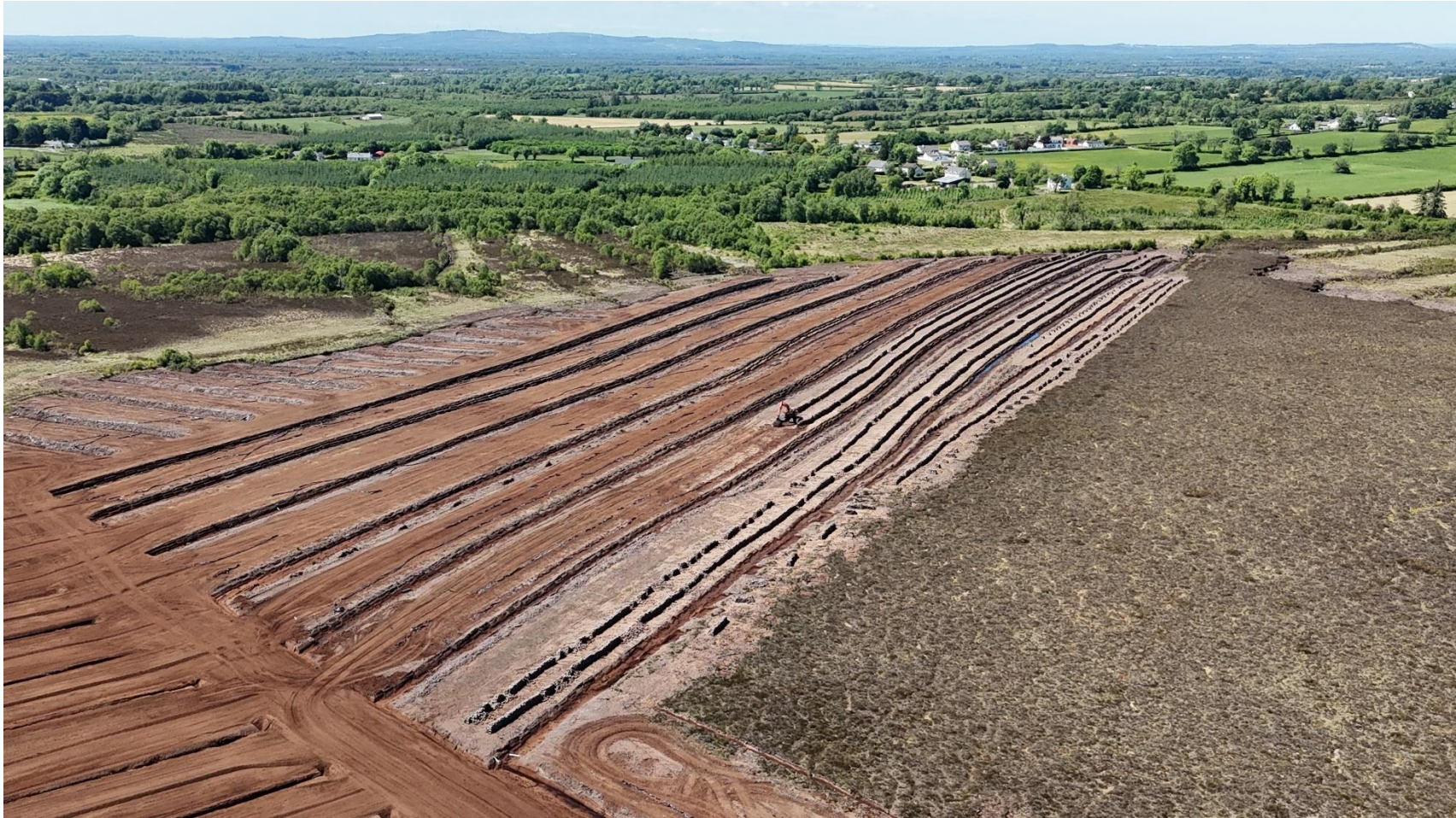
Photo 1: Excavator parked at the ‘Large sod peat’ area of the north/north western section of the peatland. Note some large sod peat had been removed since the previous Agency visit.