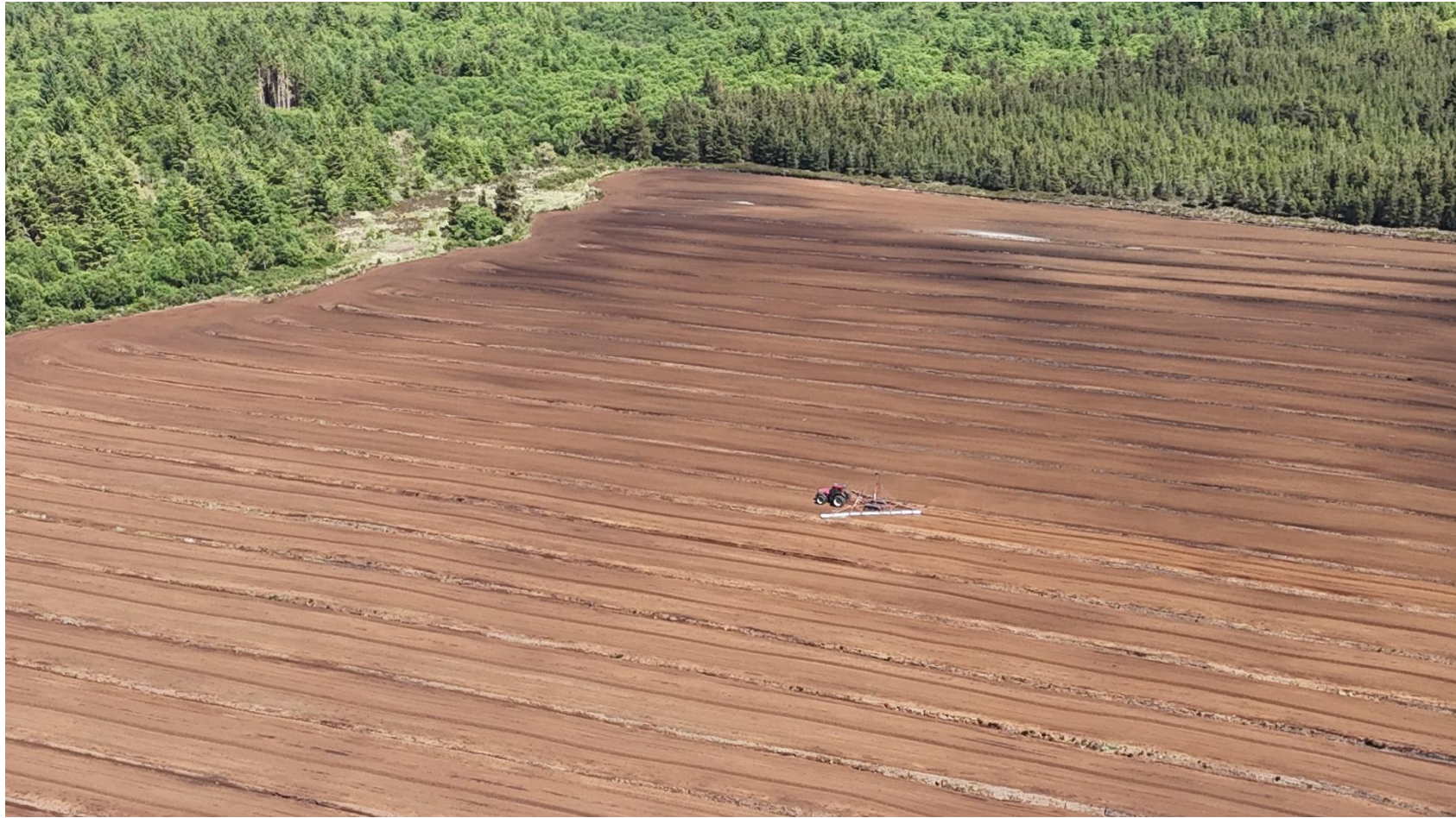
Photo 3: The ‘ridging’ of milled peat which was ongoing during the visit.