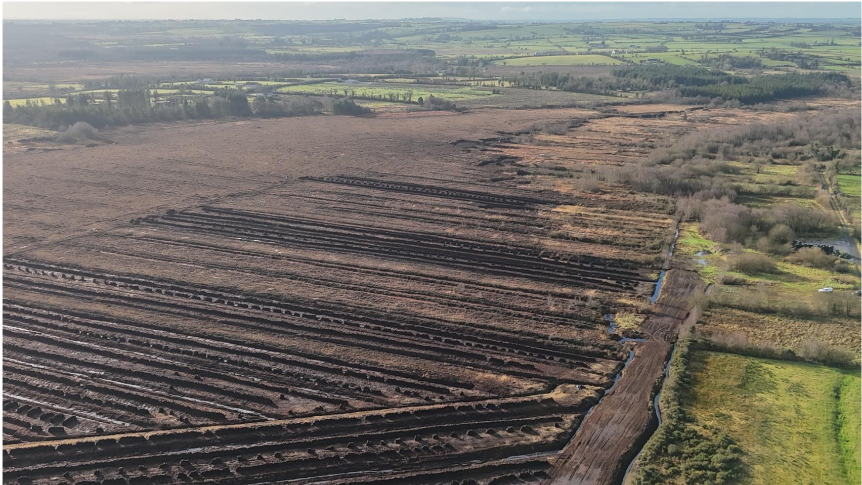
Photo 1: General overview of the peatland with rows of stacked large sod peat.