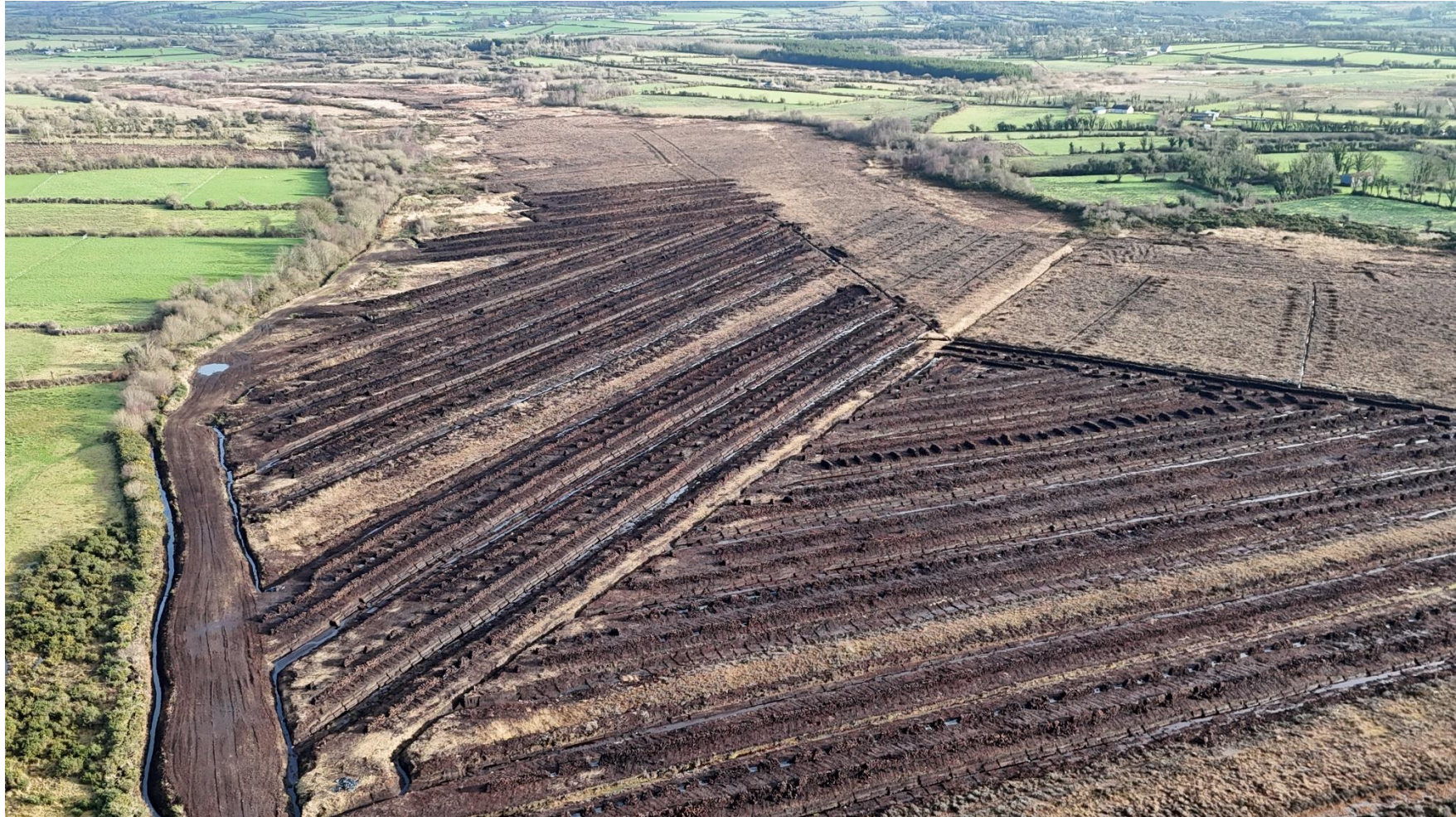
Photo 2: Photo showing large sod peat with drainage network on the peatland.