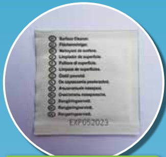
Surface Cleaner Wipe