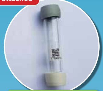
Tube Sealed by Two Caps