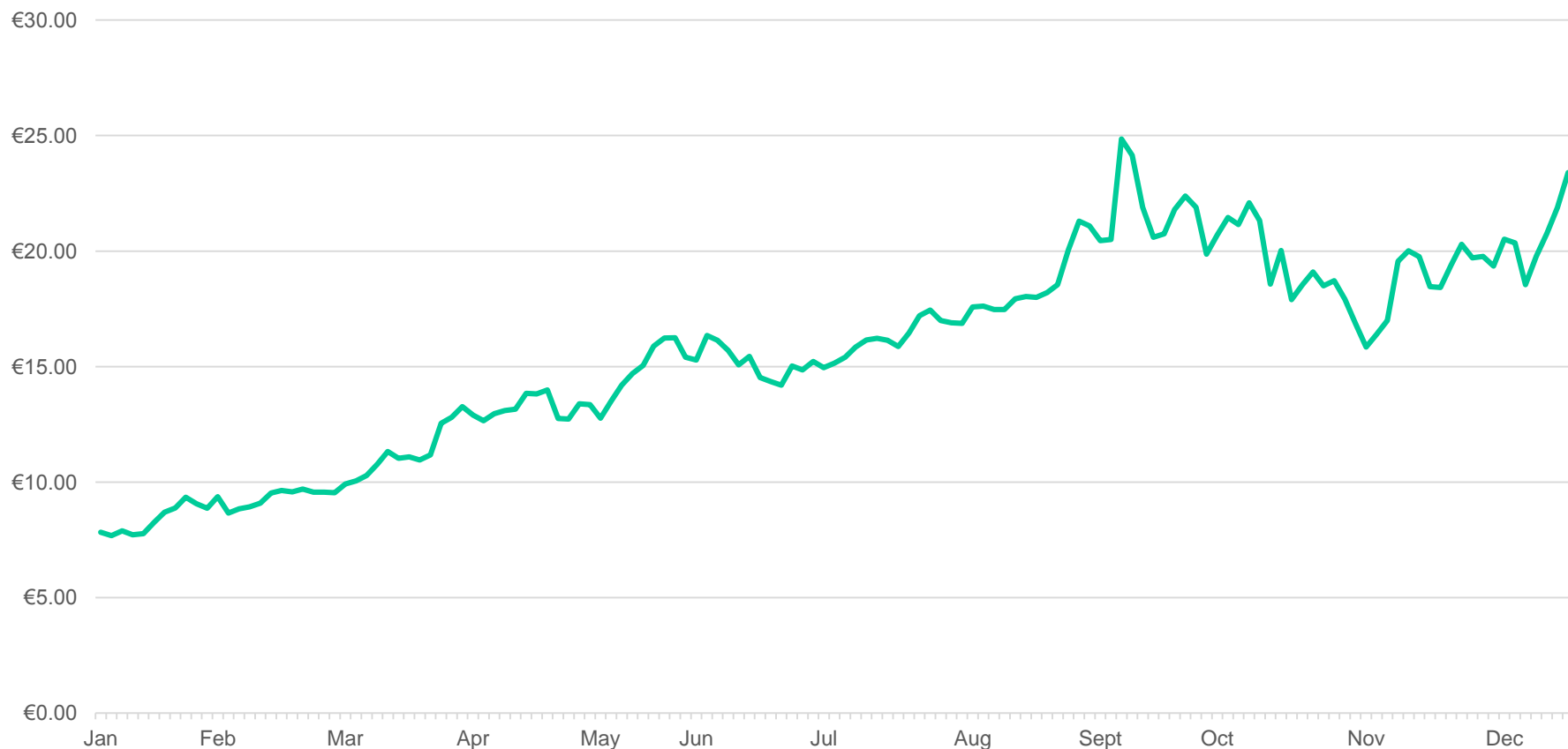
Auction Price General Allowances 2018