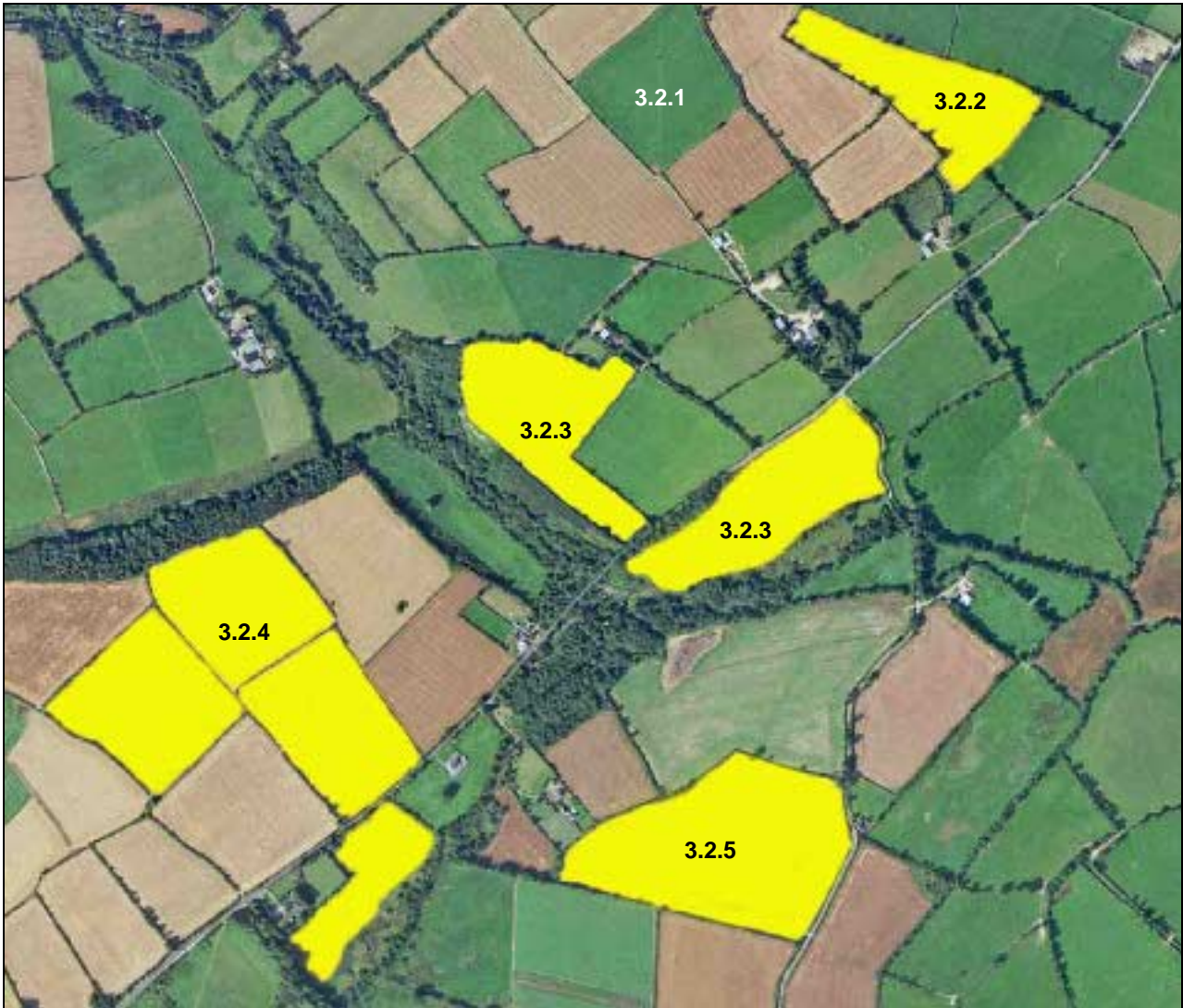
Figure 3.1. A notional aerial photograph where each scenario ( Scenarios 3.2.1, 3.2.2, 3.2.3, 3.2.4 and 3.2.5 ) takes place.

glyphosate, so in the rare circumstance that any maize seedlings did manage to survive the Irish winter these would have a selective advantage over the background flora only if their location is sprayed with glyphosate herbicide. If the spraying time coincides with competition with the surrounding flora, such as late spring/early summer, then the feral maize could possibly survive to maturity.